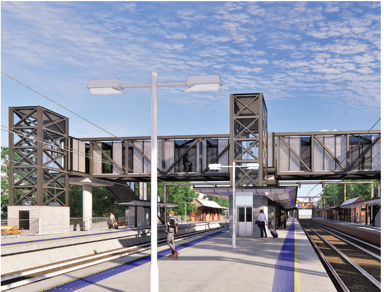
Artist's impression of the proposed Erskineville Station Upgrade, subject to detailed design