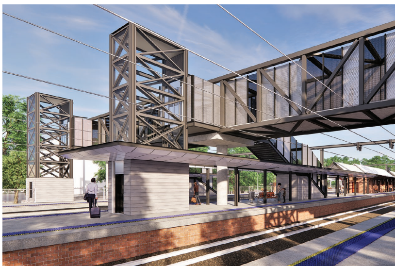
Artist's impression of the proposed Erskineville Station Upgrade, subject to detailed design

Your feedback will help Transport for NSW understand what is important to customers and the community.