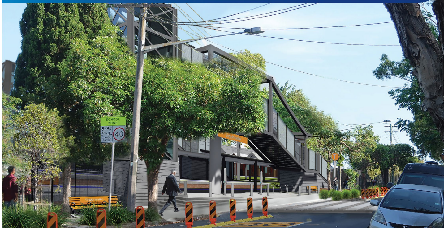
Artist's impression of the proposed Erskineville Station Upgrade, subject to detailed design