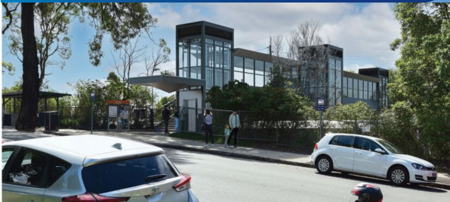
Artist's impression of the Killara Station Upgrade, subject to detailed design