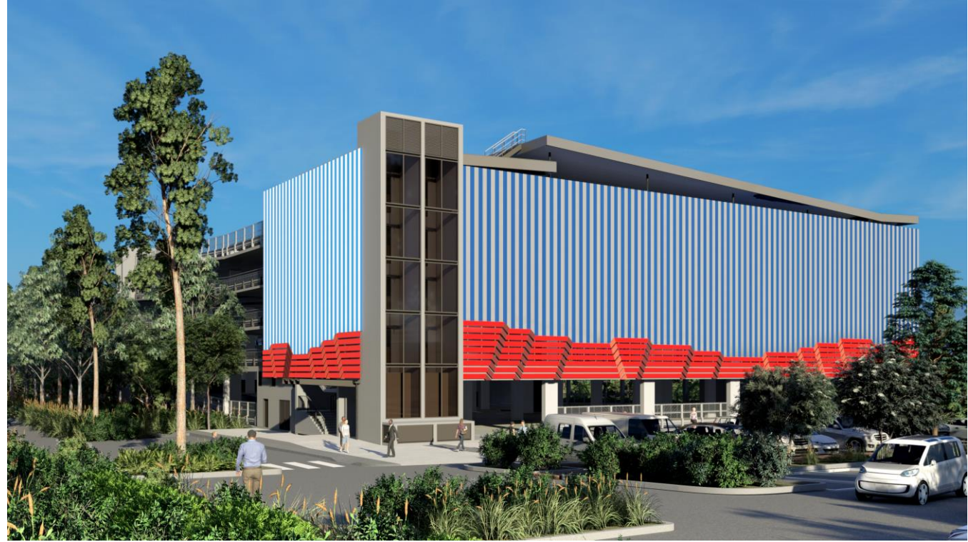
Indicative artist's impression of the façade at Leppington

Transport for NSW is delivering a multi-storey car park with approximately 1,000 additional parking spaces at Leppington Station to provide you with more convenient access to public transport and reduce congestion on our roads.