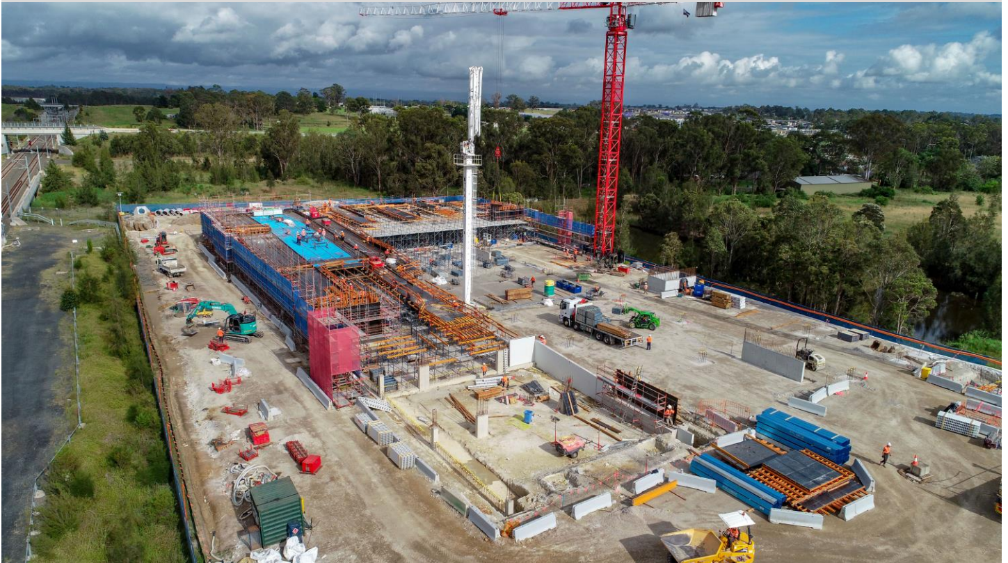
Construction progress on the new multi-storey car park at Leppington, November 2020

Transport for NSW is delivering a multi-storey car park with approximately 1,000 additional parking spaces at Leppington Station to provide you with more convenient access to public transport and reduce congestion on our roads.