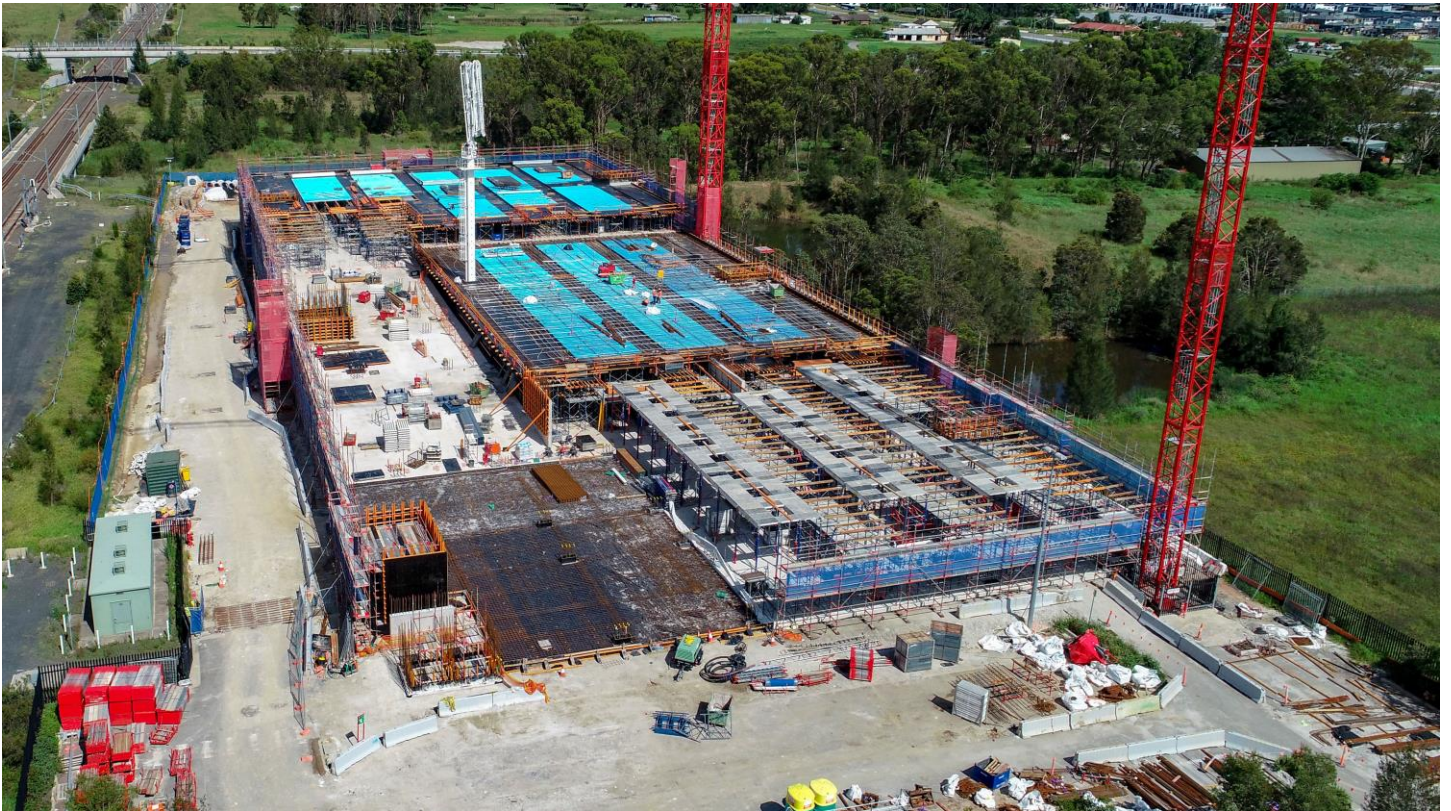
Construction progress on the new multi-storey car park at Leppington, January 2021

Transport for NSW is delivering a multi-storey car park with approximately 1,000 additional parking spaces at Leppington Station to provide you with more convenient access to public transport and reduce congestion on our roads.