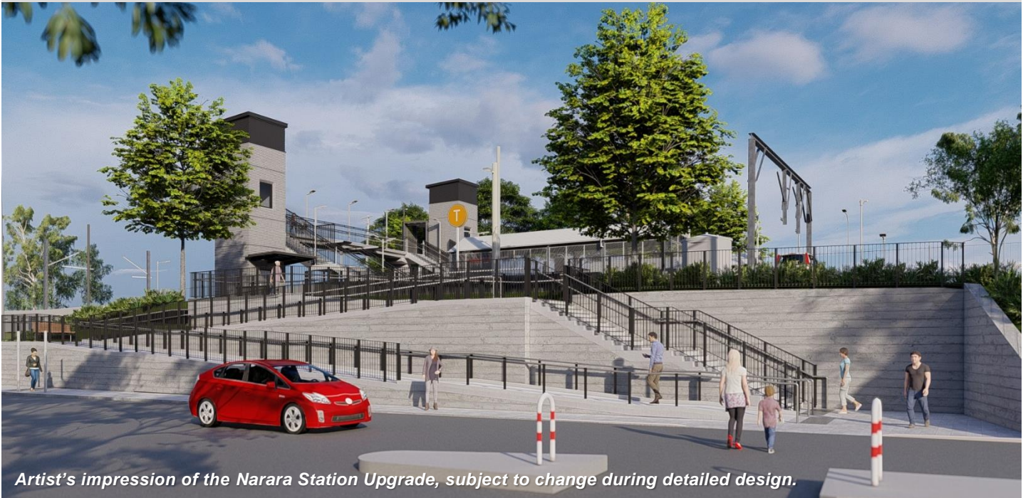
Artist's impression of the Narara Station Upgrade, subject to change during detailed design.

Construction on the Narara Station upgrade is progressing well with lift shaft fit out and Narara Valley Drive ramp construction underway.