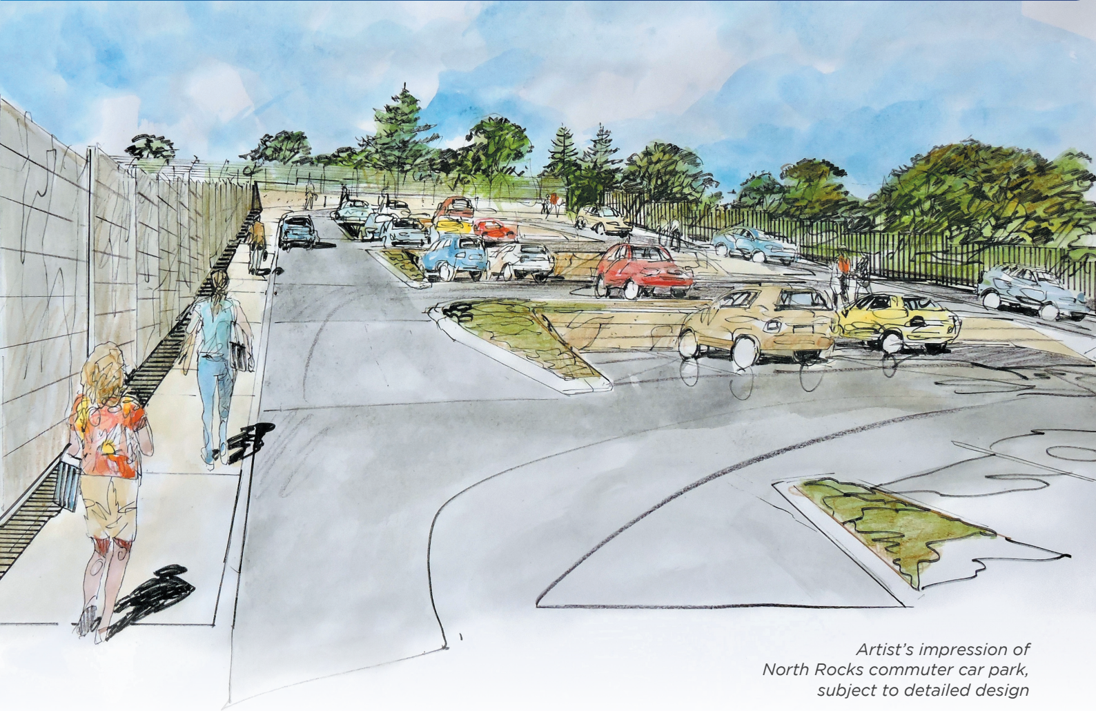
Artist's impression of North Rocks commuter car park, subject to detailed design