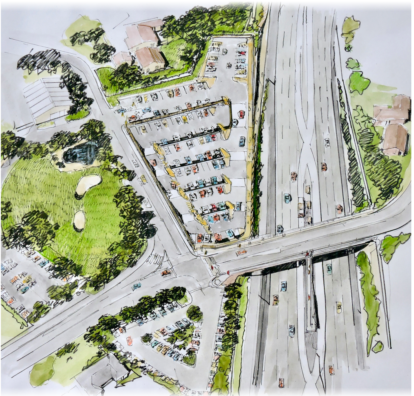
Artist's impression of North Rocks commuter car park, subject to detailed design

During the next phase of design, we will prepare an Urban Design and Landscape Plan which will consider urban heat, landscaping and planting of trees in the area.