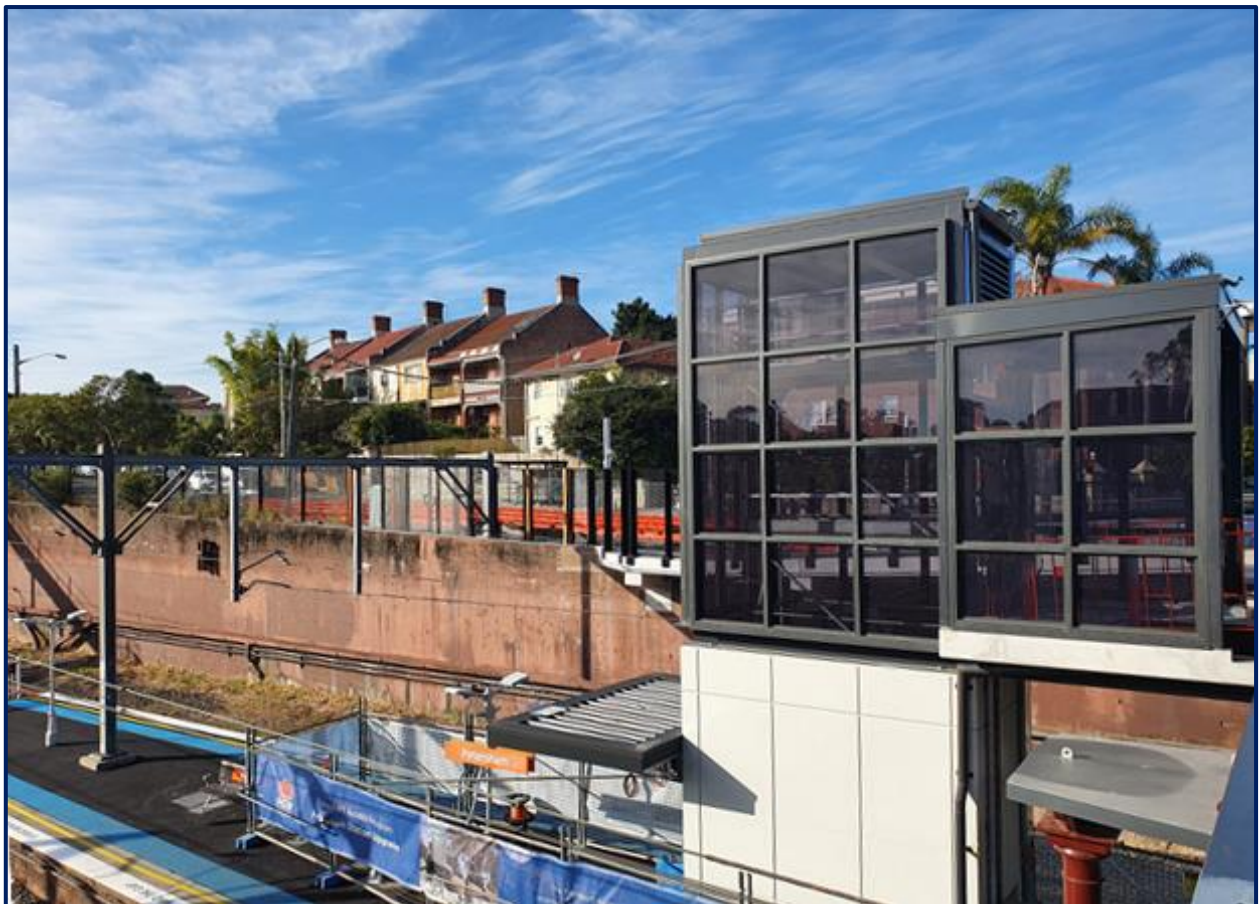
Above: Continued work on the new lift shafts at Petersham Station in June

Equipment to be used includes excavators, tipper and delivery trucks, concrete pumps, concrete trucks, truck-mounted crane, power and hand tools.