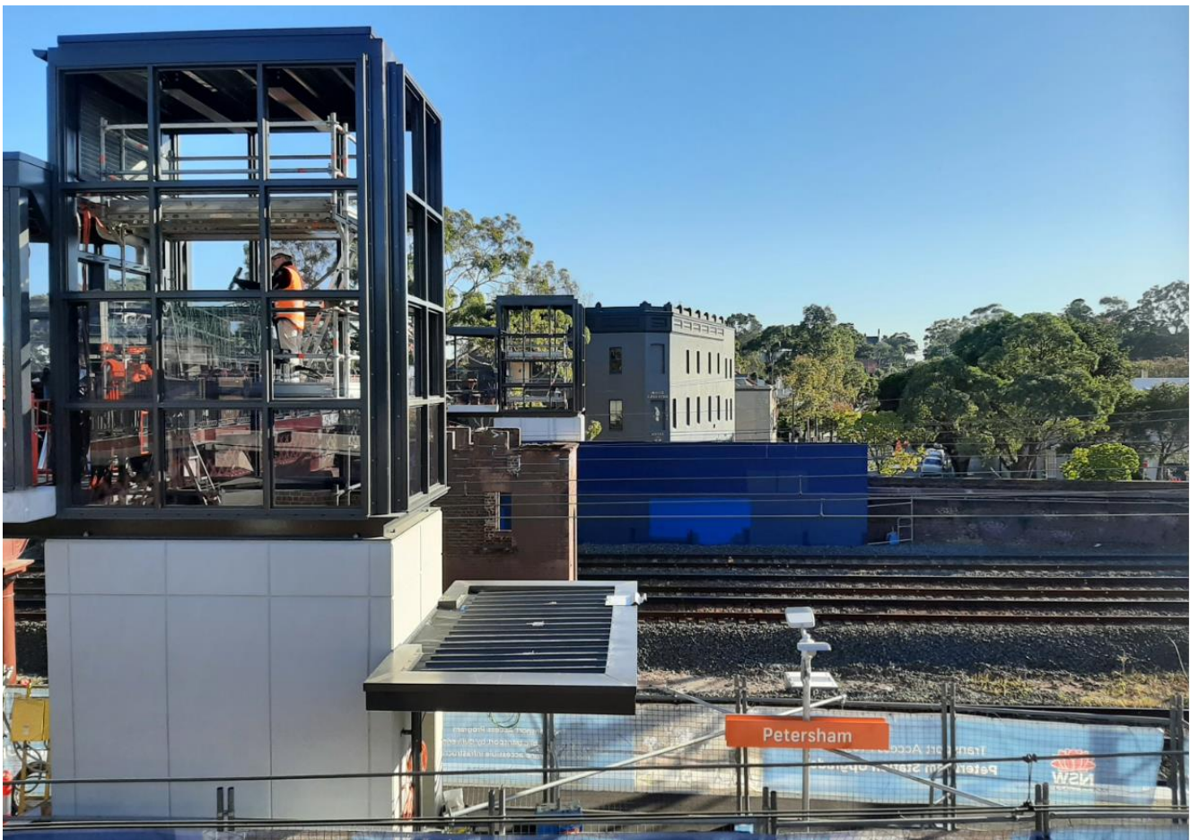
Above: Glass panels being installed in the new lifts at Petersham Station in May.

Equipment to be used includes excavators, tipper and delivery trucks, concrete pumps, concrete trucks, truck-mounted crane, power and hand tools.