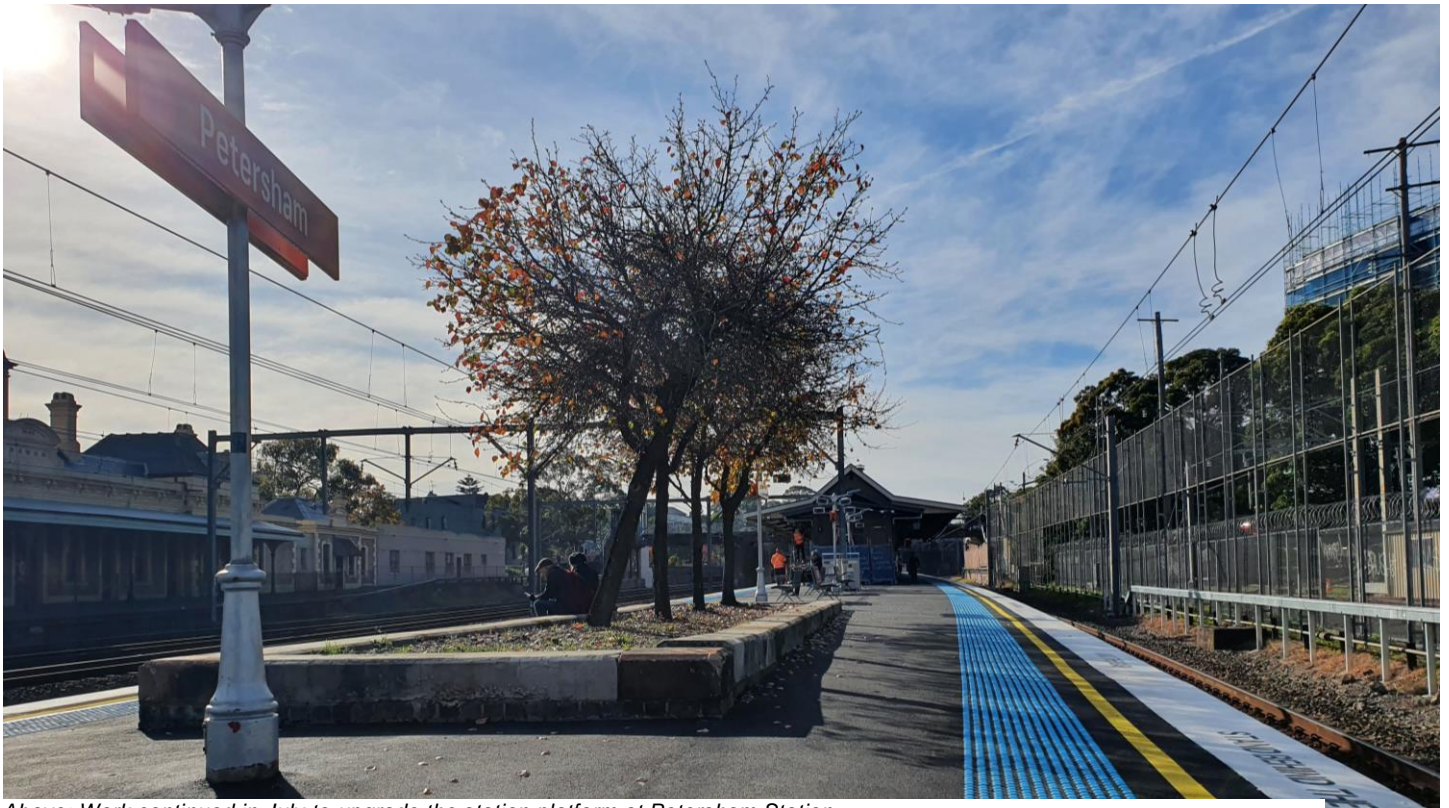
Above: Work continued in July to upgrade the station platform at Petersham Station.

The safety and wellbeing of our workforce and the wider community is our highest priority. Our workers and worksites follow NSW Health's COVID-19 requirements and will continue to do so.