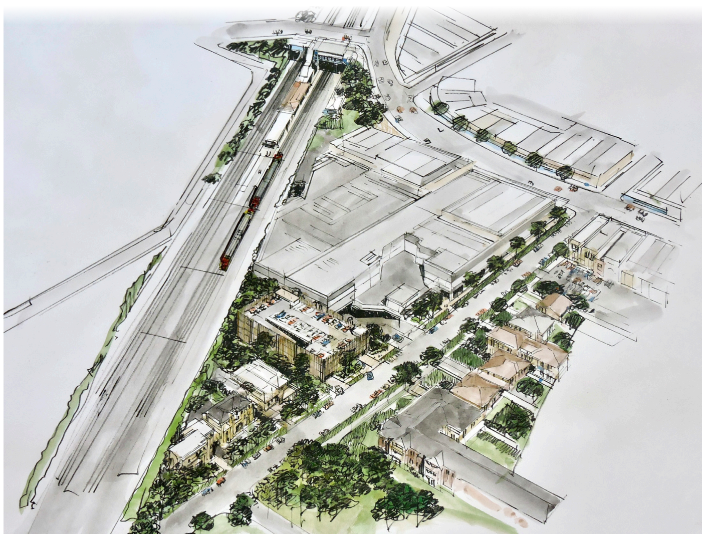
Indicative artist's impression of proposed commuter car park at Riverwood, subject to detailed design

We received feedback from the community on design considerations for the commuter car park. Feedback received from the community will be considered during the detailed design phase of the project.