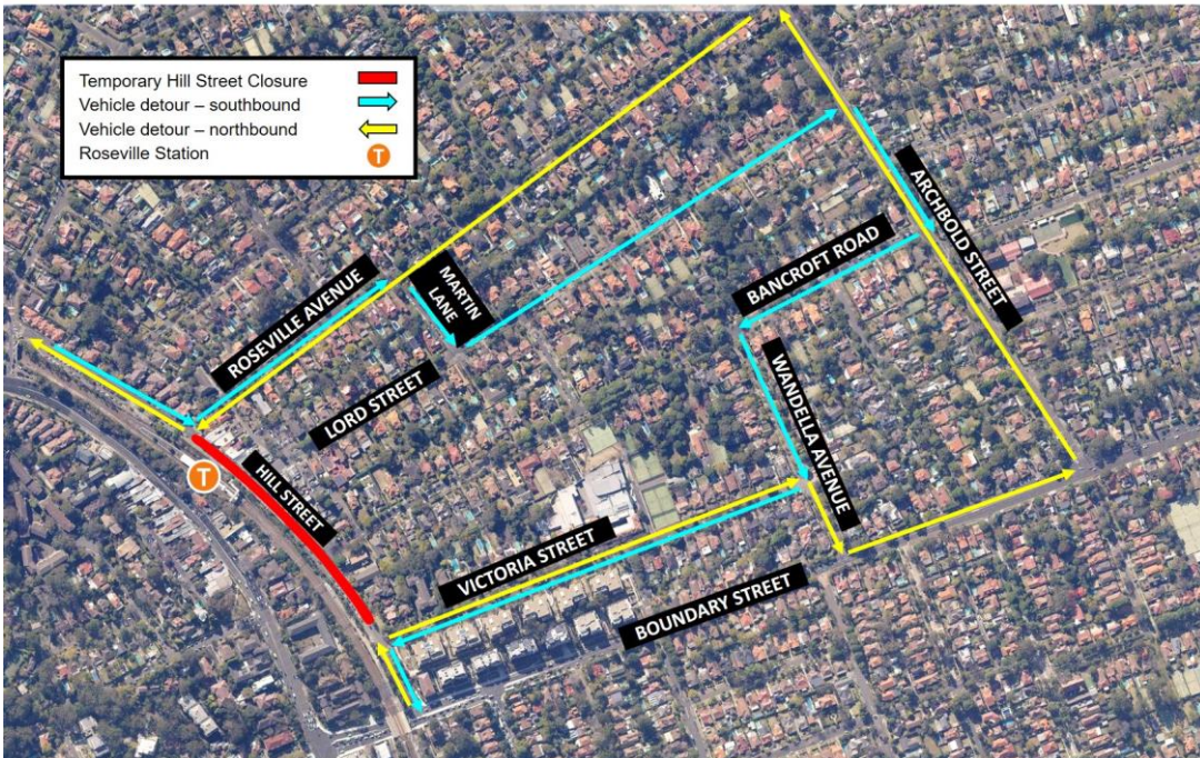
Map of vehicle detours from 10pm Friday 4 June to 8pm Sunday 6 June

Vehicle diversions will be in place from 10pm Friday 4 June to 8pm Sunday 6 June. Residential and emergency vehicle access will be maintained at all times. Traffic controllers will be in place to assist motorists. Signage, including large variable messaging boards, will be installed to communicate the upcoming changes to the community. Traffic control and detour signage will also be implemented at the commencement of the closure.