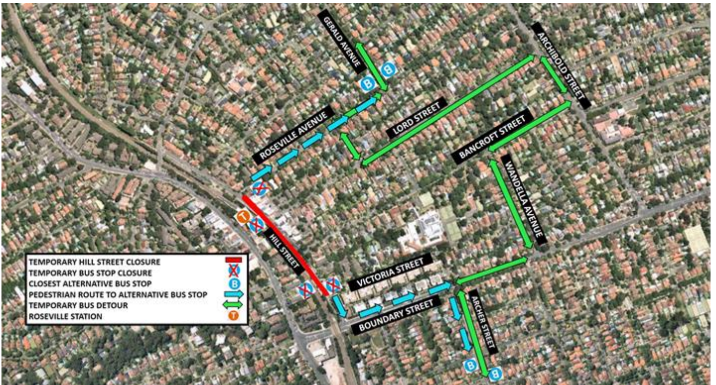
Bus stop closures and diversions from 10pm Friday 4 June to 5am Monday 7 June