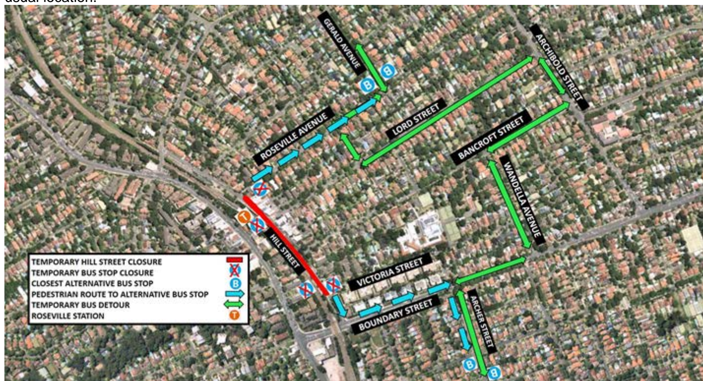
Bus stop closures and diversions from 10pm Friday 4 June to 5am Monday 7 June

Please visit www.transportnsw.info or call 131 500 for up to date information regarding service updates and replacement buses during this time. Rail Replacement bus stops will be located on the Pacific Highway in the usual location.