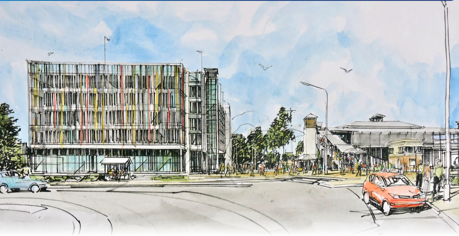
Artist's impression of St Marys commuter car park, subject to detailed design.