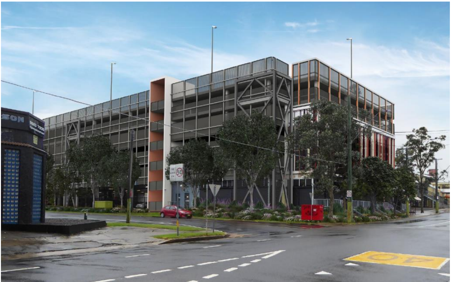
Artist's impression of St Mary's Commuter Car Park, subject to detailed design

Transport for NSW is providing additional commuter parking at St Marys, a joint initiative of the Australian and NSW Governments. Additional commuter car parking at St Marys Station will provide the community with more convenient access to public transport and reduce congestion on our roads.