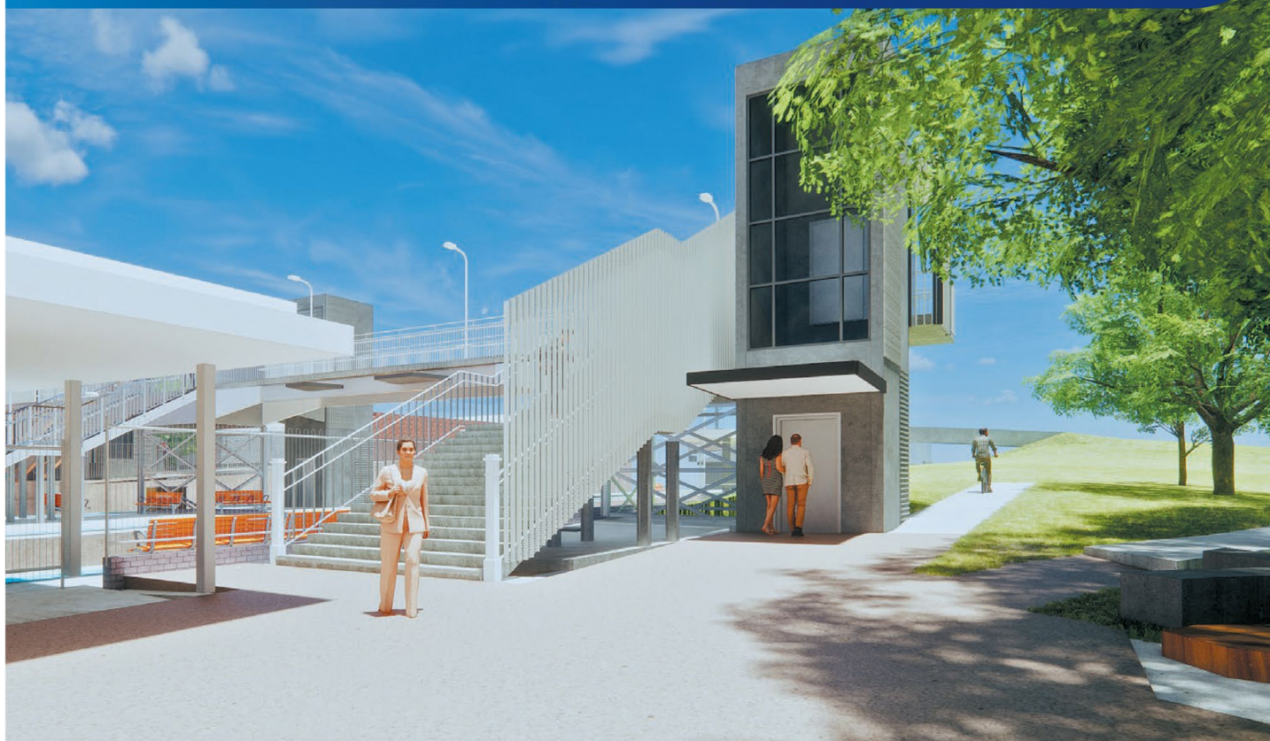
Artist's impression of the Thornleigh Station Upgrade, subject to detailed design.