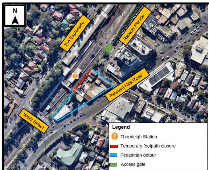
Map of Stage 3

During this period, access to and from Thornleigh Station will be along Pennant Hills Road and via the footpath from Wells Street. Please allow extra time to access the station from Railway Parade.