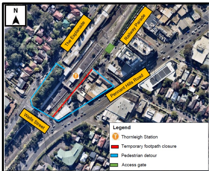
Map of Stage 2

A temporary full footpath closure will be in place on the east side of the station between Railway Parade and Wells Street throughout August. This is to allow for piling activities for the new lift to be carried out. Access to and from the station will be via The Esplanade only.