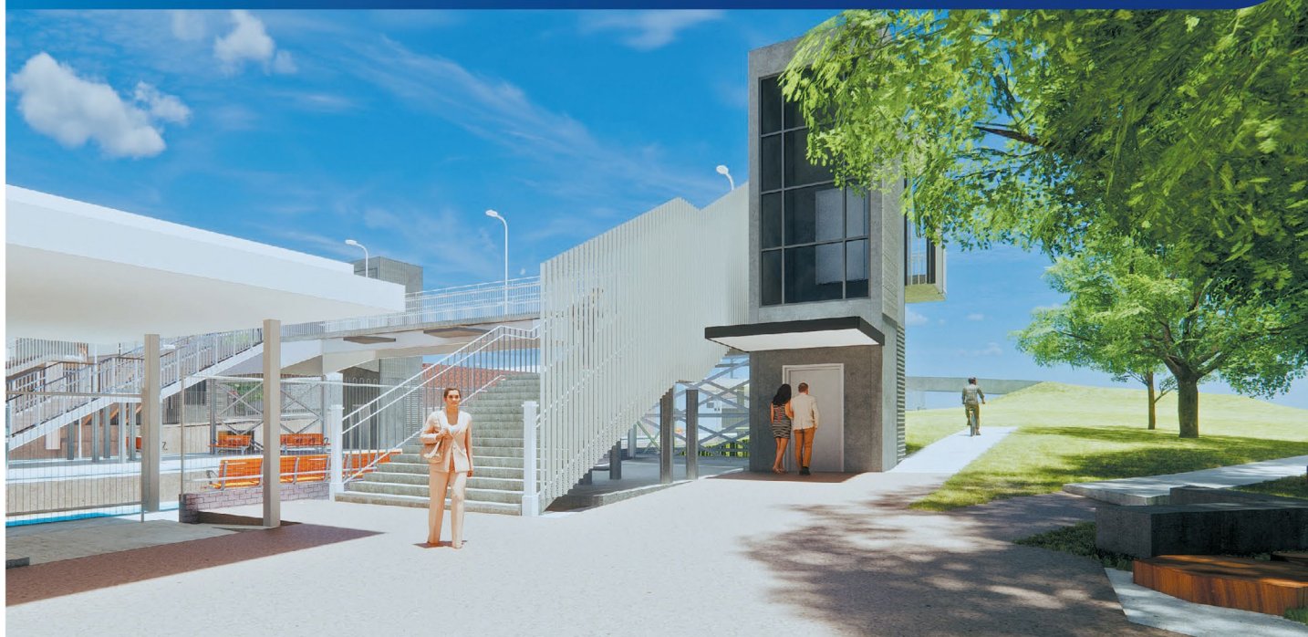
Artist's impression of the proposed Thornleigh Station Upgrade, subject to detailed design.