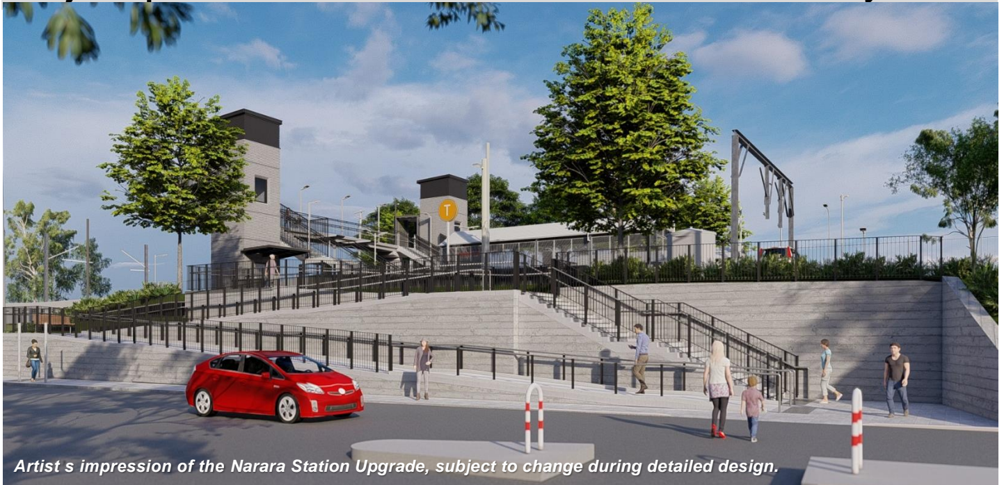
Artist's impression of the Narara Station Upgrade, subject to change during detailed design.

Construction on the Narara Station upgrade is progressing well with lift shaft installation underway during April.