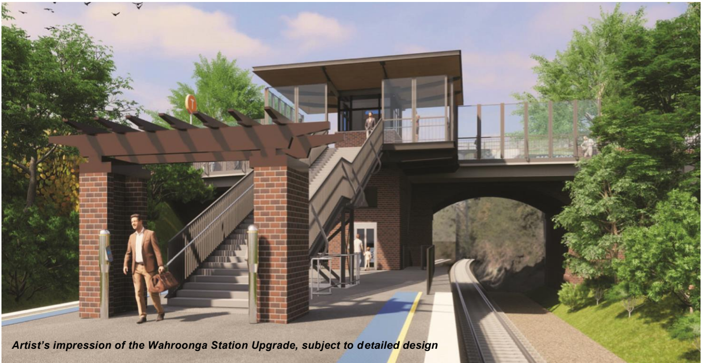
Artist's impression of the Wahroonga Station Upgrade, subject to detailed design

Construction on the Wahroonga Station Upgrade is progressing well with service investigation and piling work underway during February.