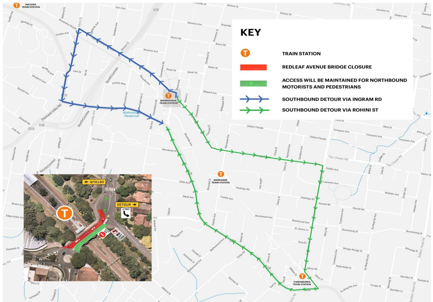
Map of traffic detour from 8am Saturday 10 April – 2am Sunday 6 June 2021.

The southbound lane on Redleaf Avenue bridge will be temporarily closed from 8am Saturday 10 April to mid-June 2021. Detours will be in place for southbound motorists via Ingram Road or Rohini Street. Access will be maintained for northbound traffic.