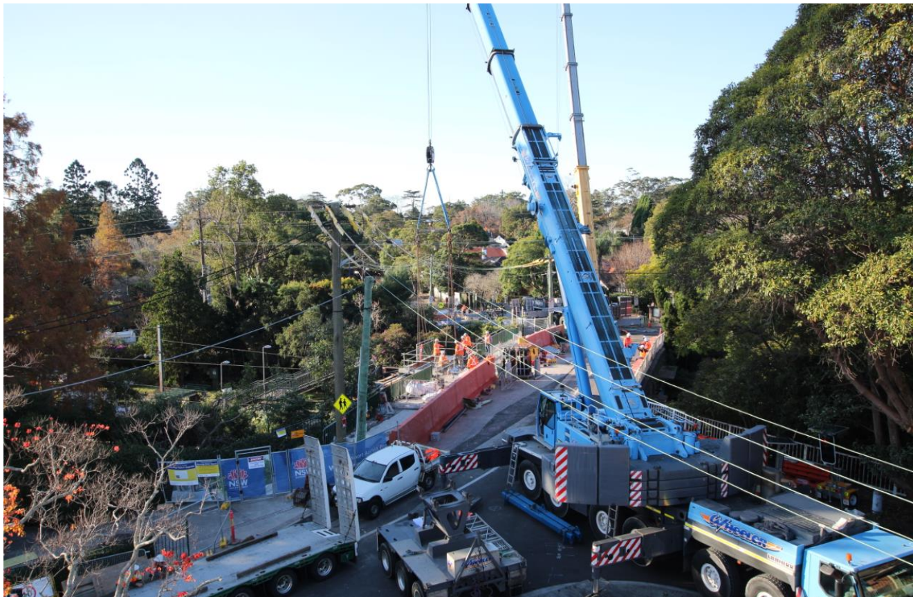
Cranes parked on Redleaf Avenue bridge, 12-14 June 2021

We are making great progress on the project, and are on target for early 2022 completion.