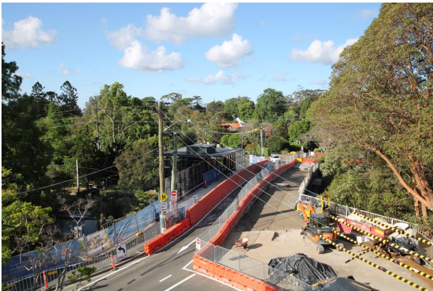
Image: Wahroonga Station mid-October works of southbound concrete road deck construction, temporary pedestrian walkway and lift shaft glazing completed.

Equipment to be used includes tipper trucks, concrete pumps and concrete trucks, vacuum trucks, piling rigs, cranes, small excavators, saw cutters, rollers, surveying equipment and hand tools.