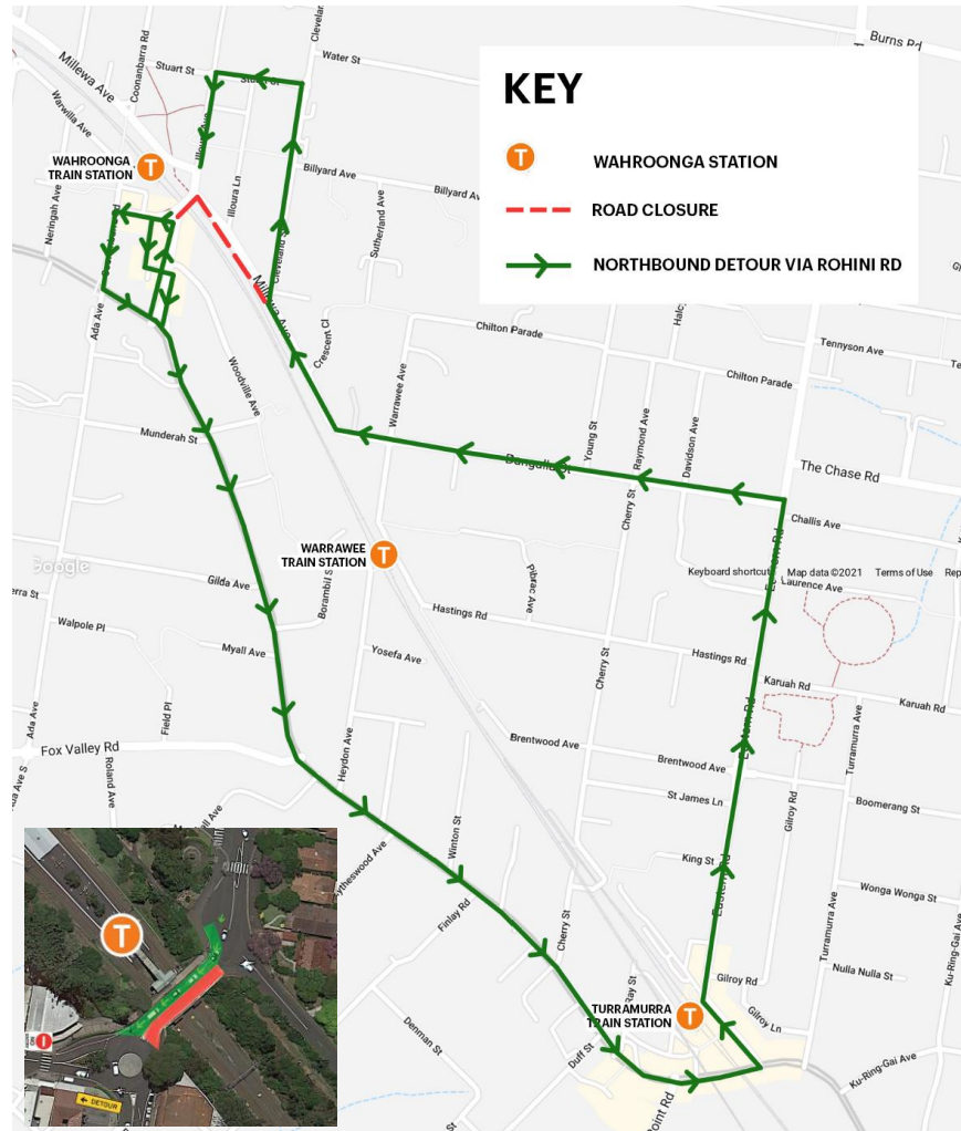
Map of traffic detour in place until Monday 29 Nov

Millewa Avenue will remain closed between Cleveland Street and Illoura Avenue for Westbound motorists until 26 November 2021 Please use the detour via Cleveland Street during this time.