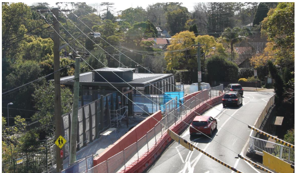
Image: Wahroonga Station mid-August, entry with new canopies, anti-throw screens and glazing in place, and temporary pedestrian walkway.

Equipment to be used includes tipper trucks, concrete pumps and concrete trucks, vacuum trucks, piling rigs, cranes, small excavators, saw cutters, rollers, surveying equipment and hand tools.