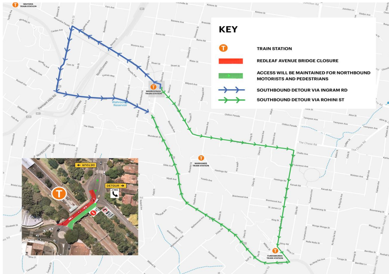
Map of traffic detour to mid-June 2021.

The southbound lane on Redleaf Avenue bridge will be temporarily closed from 8am Saturday 10 April to mid-June 2021 to allow work to be carried out safely. Detours will be in place for southbound motorists via Ingram Road or Rohini Street. Access will be maintained for northbound traffic.