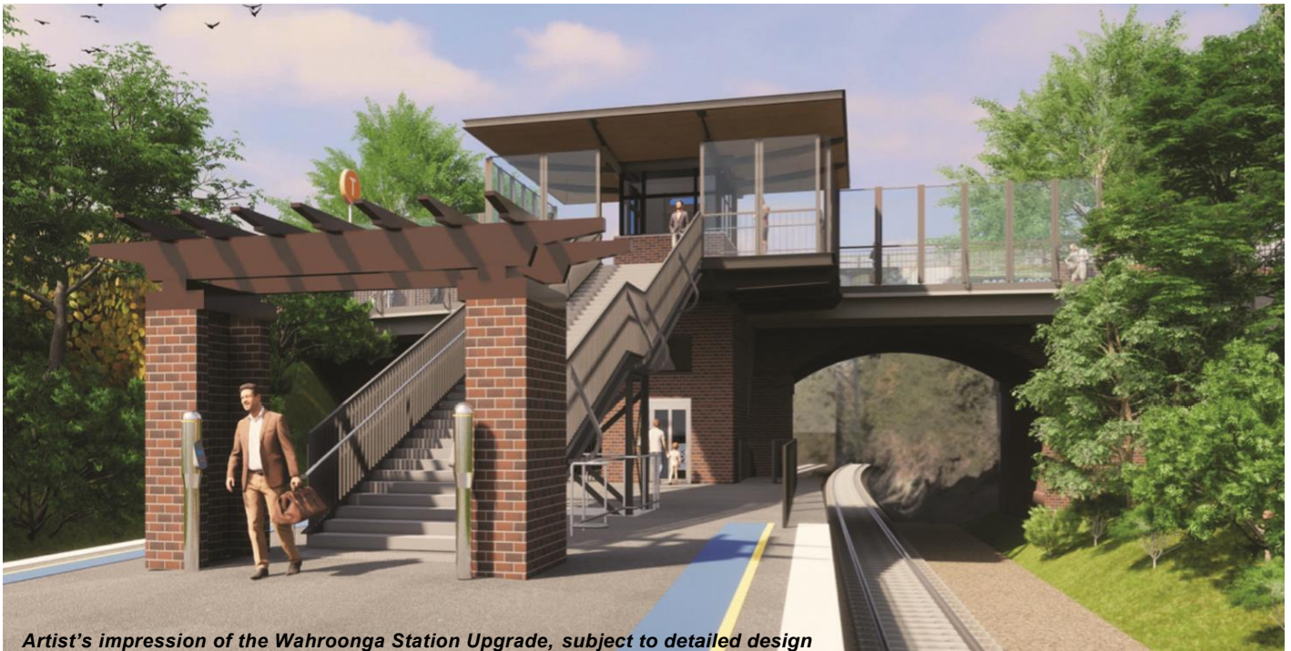
Artist's impression of the Wahroonga Station Upgrade, subject to detailed design

Transport for NSW is upgrading Wahroonga Station to make it easier for everyone to access, including people with a disability or limited mobility, parents/carers with prams, and customers with luggage.