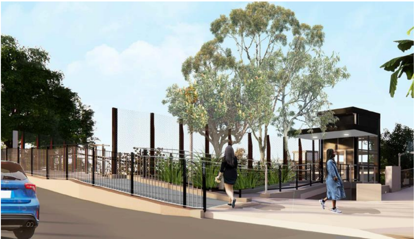
Updated artist's impression of Wollstonecraft Station Upgrade