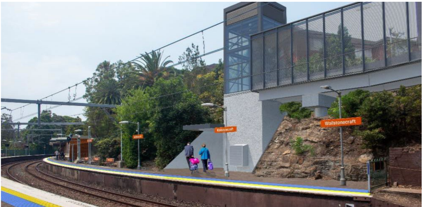
Artist's impression of Wollstonecraft Station Upgrade