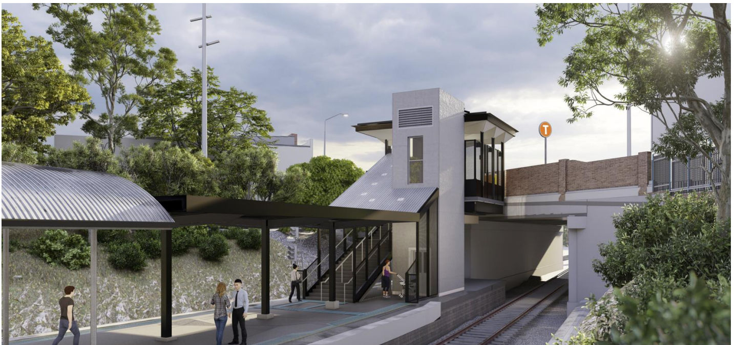
Above: Artist's impression of the upgraded Yagoona Station.