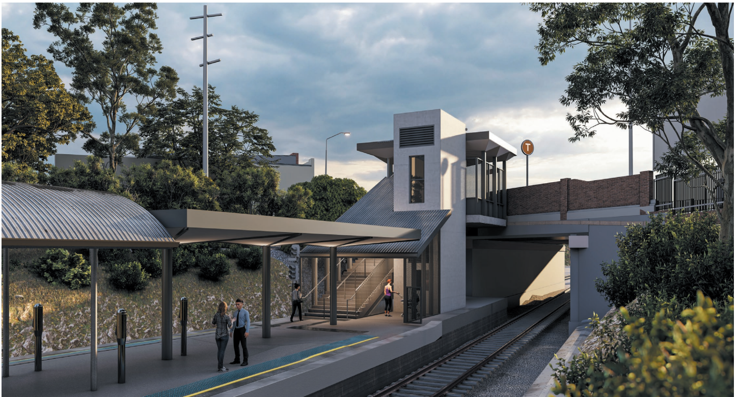
Artist's impression of Yagoona Station Upgrade, subject to detailed design