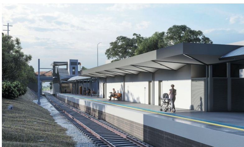
Artist's impression of Yagoona Station Upgrade, subject to detailed design

Other key themes that were identified in the feedback include request for increased safety measures including lighting and CCTV cameras and general improvements to the station and surrounding areas.