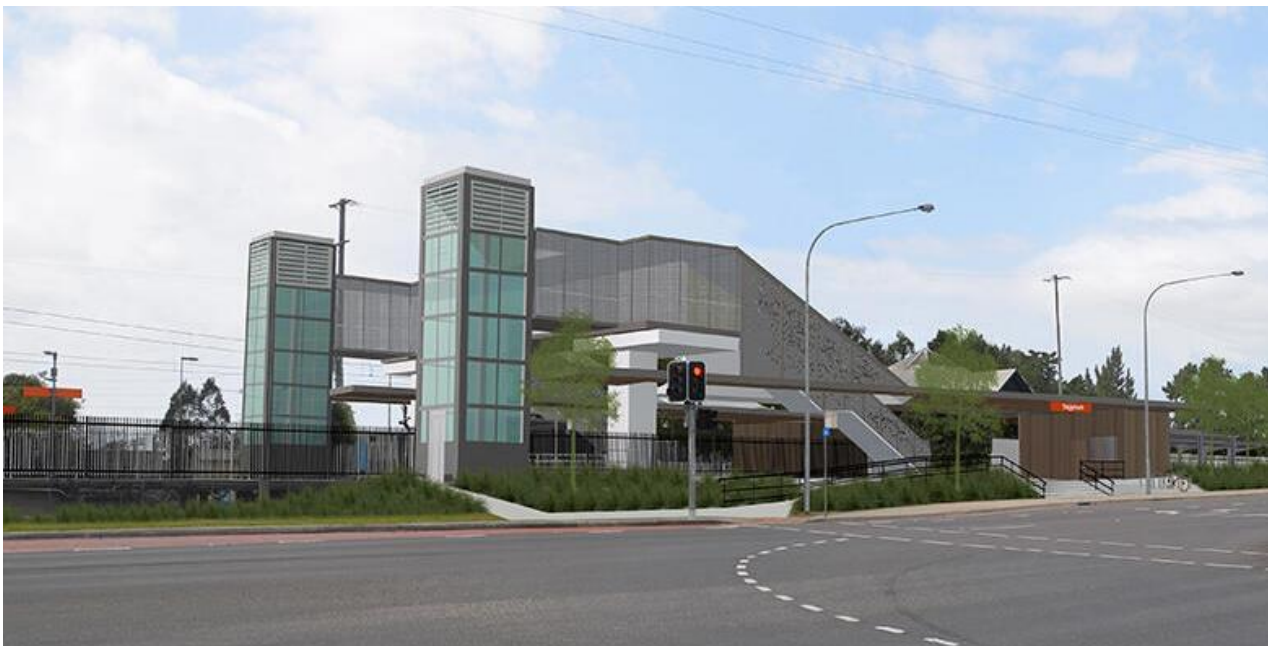
Artist's impression of the Tuggerah Station Upgrade from the west, subject to detailed design