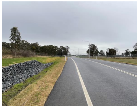
New road pavement, drainage and landscaping to the new Aerotropolis metro station.