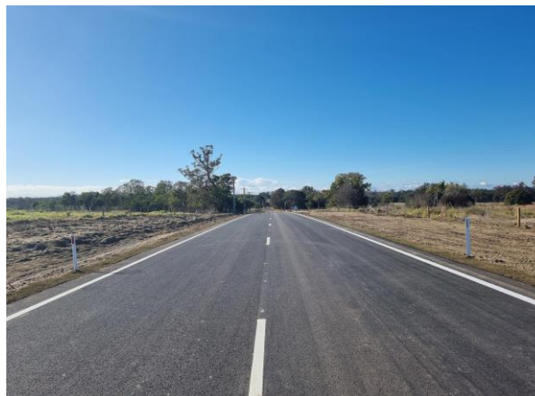
Pitt Street widening and upgrade to cater for heavy construction vehicles.