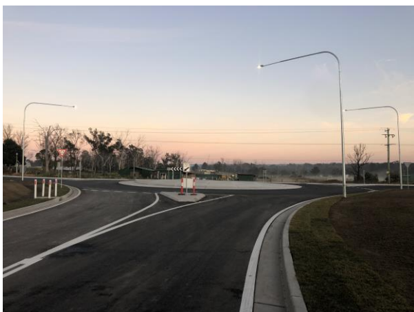
New roundabout at 215 Badgerys Creek Road.