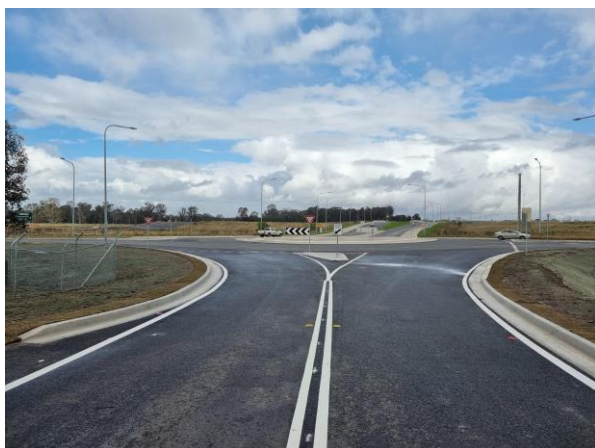
New leg of the Elizabeth Drive and Badgerys Creek Road roundabout.

We would like to thank the community for their patience and cooperation during this important work.