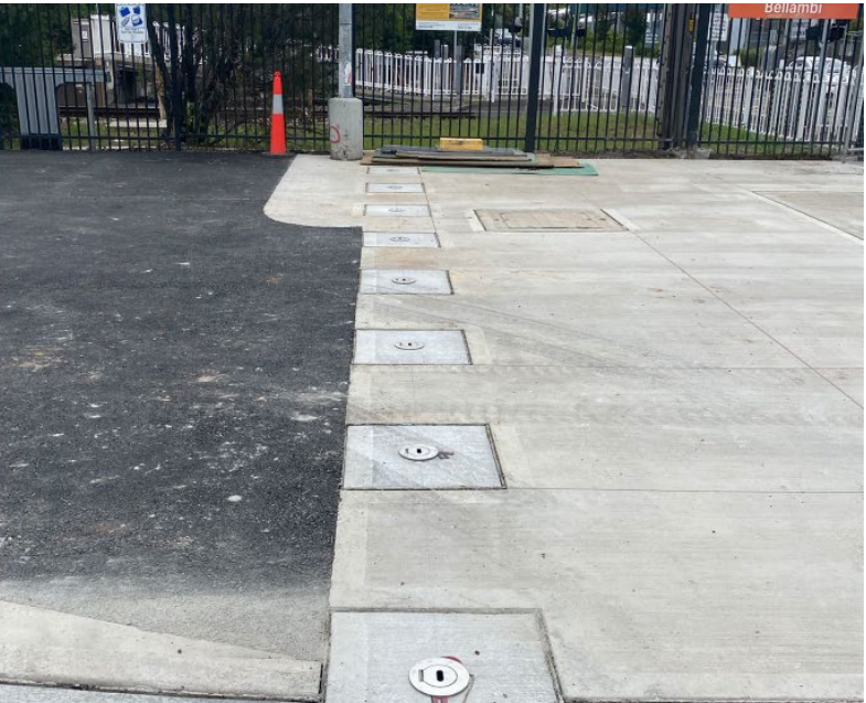
Work on the new footpaths and lighting around the kiss and ride zone continued in December.