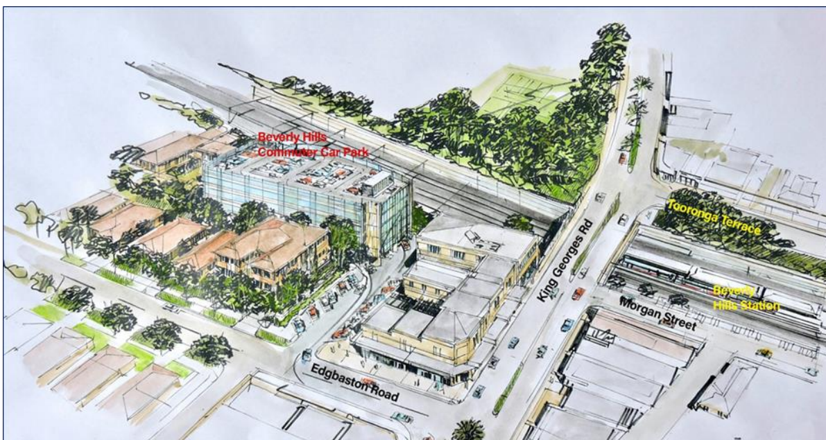
Artist's impression of the proposed commuter car park, subject to Planning Approval and detailed design