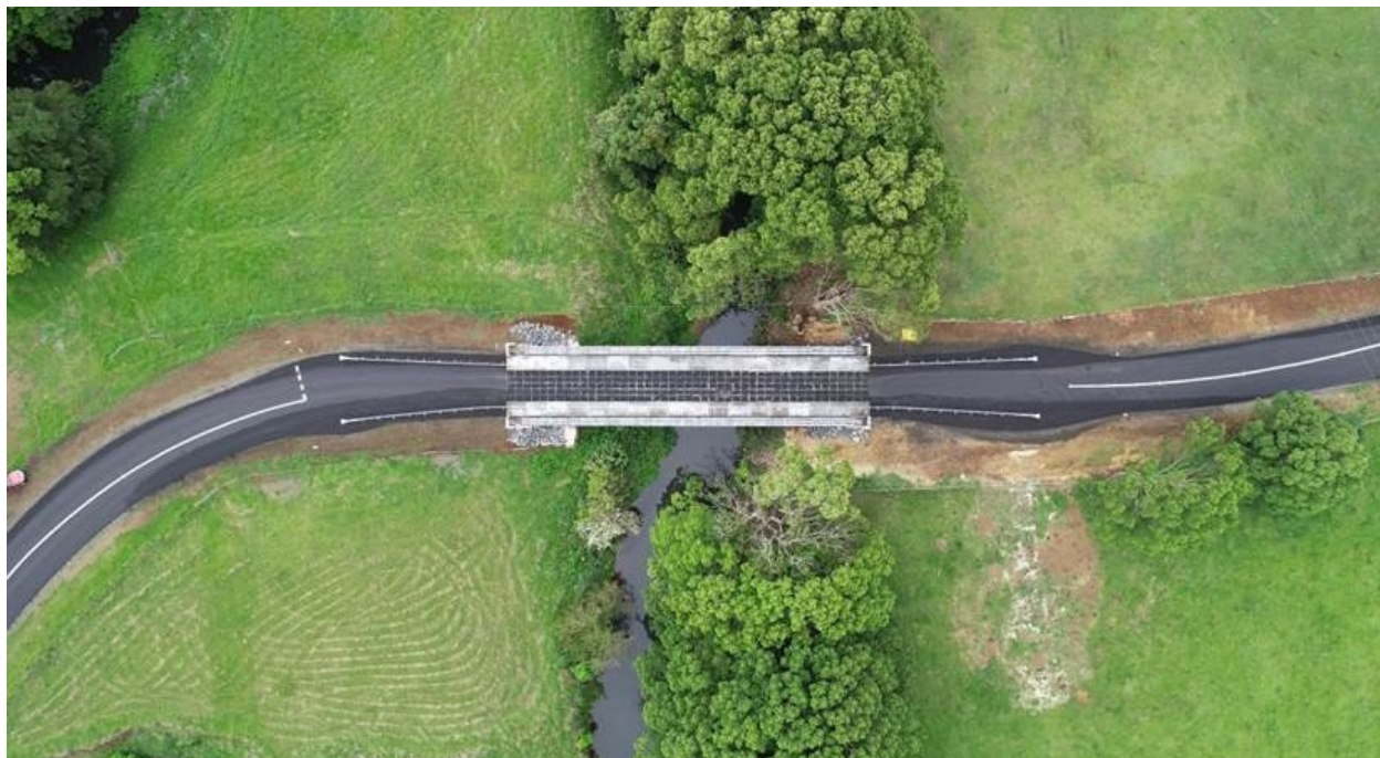
Brookers Bridge pre-upgrade, Singleton NSW