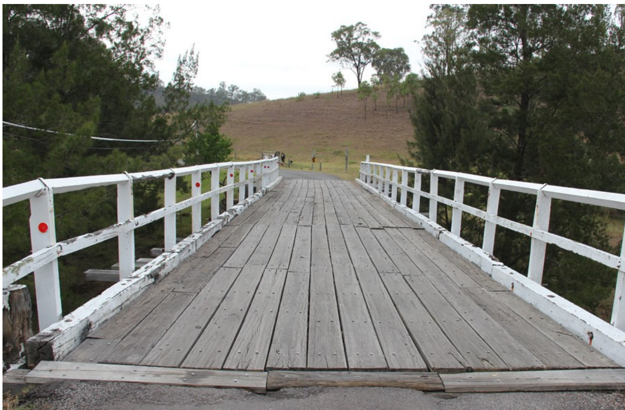
Parkers Bridge near Bangalow NSW