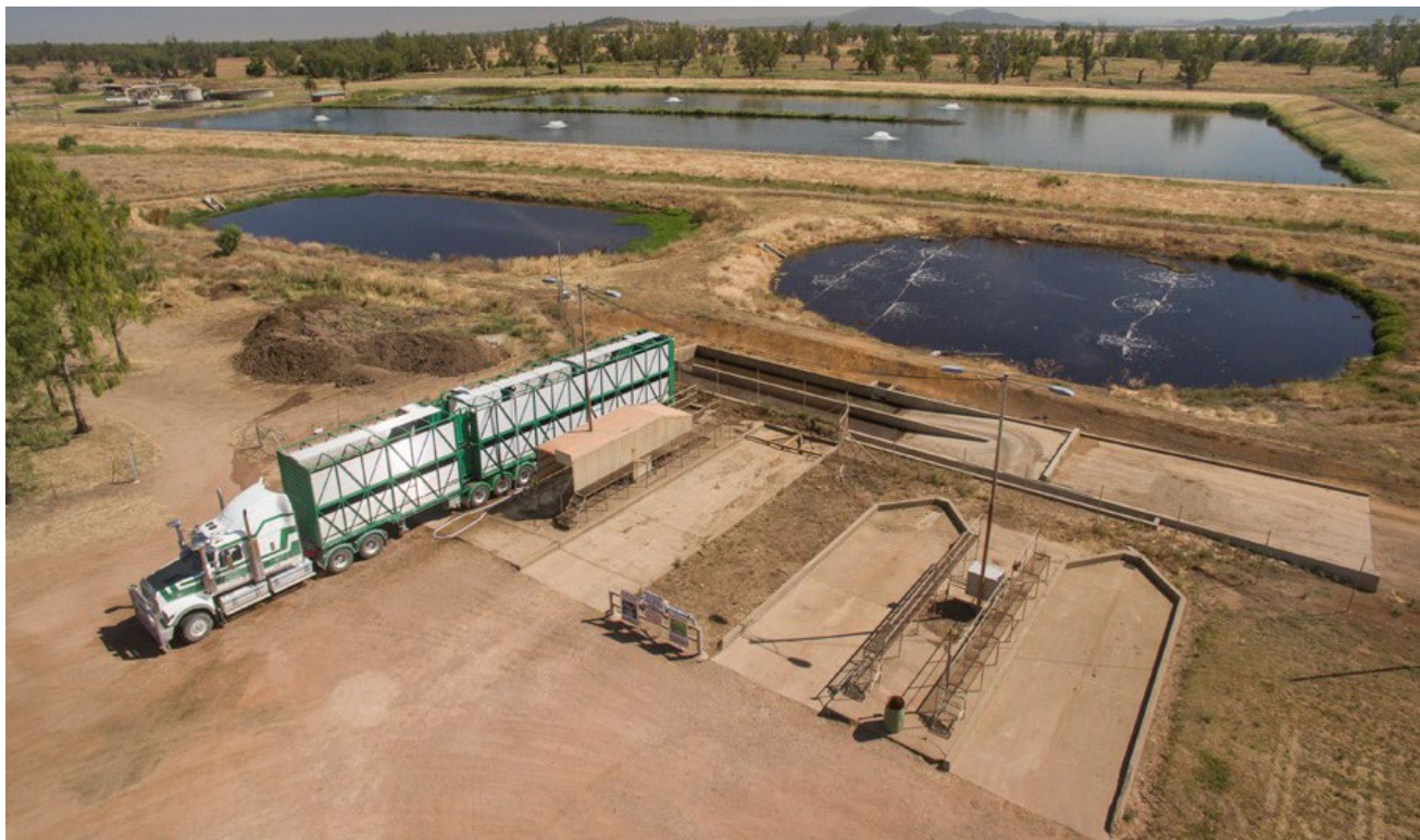
Truck Wash in Gunnedah