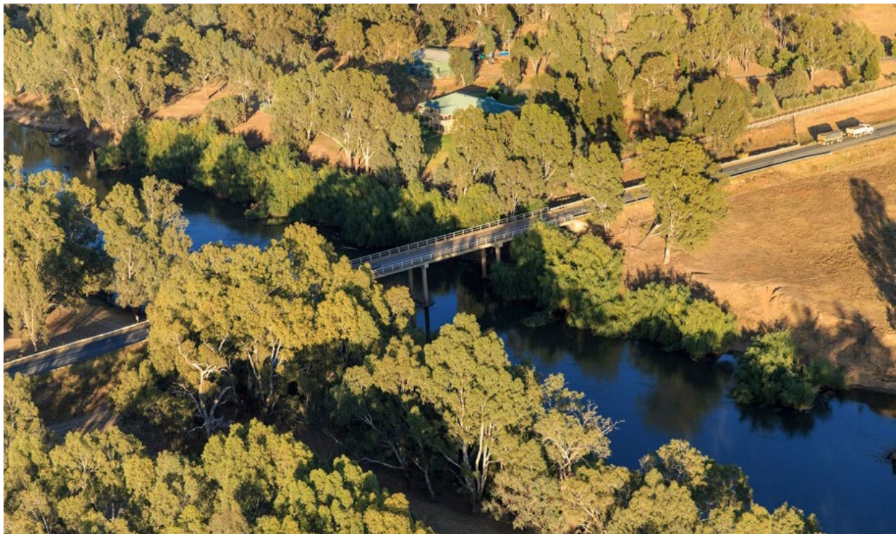
Tenterden Road Bridge, Guyra