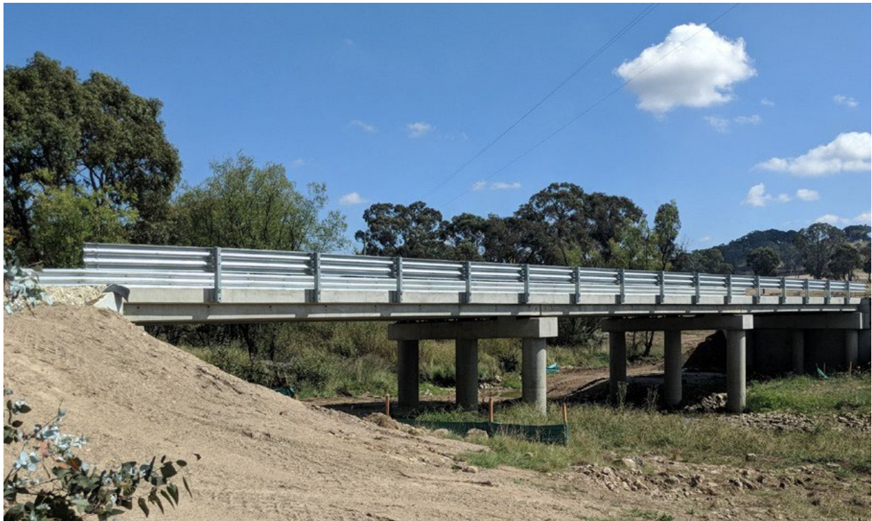
Eunony Bridge, Wagga Wagga