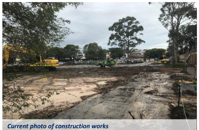
Current photo of construction works

The equipment used during the work will include vacuum trucks, excavators, surveying equipment, spoil removal trucks and hand tools.