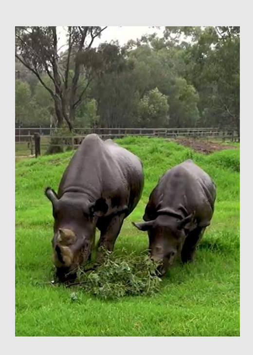
'Bakhita' and her one-year-old calf 'Sabi' two of the Zoo's endangered Southern Black Rhinos - enjoyed feasting on the Kurrajong.