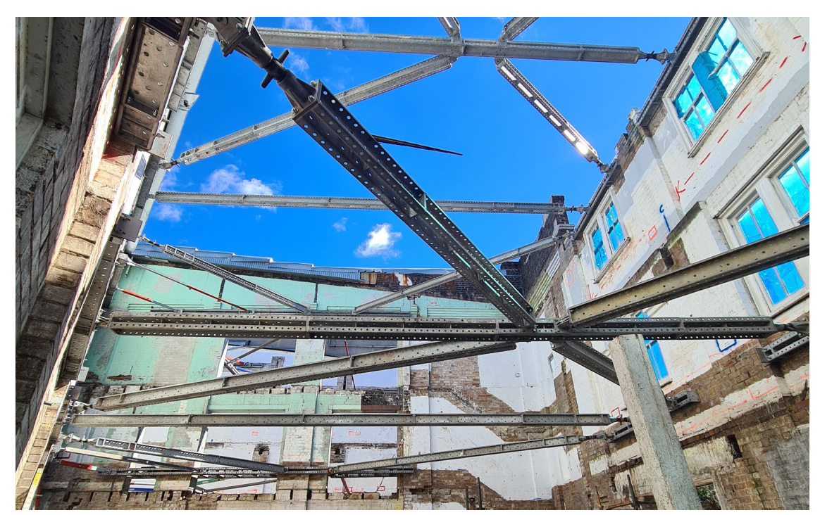
Image above shows structural work inside 125-127 Little Eveleigh Street

Work on the new station entrance at 125-127 Little Eveleigh Street has also progressed. The piling is now complete and we are well into construction of the building foundation and services installation.