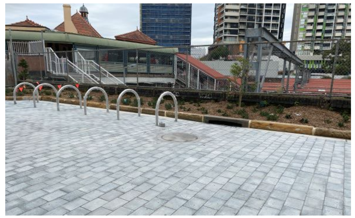
Image above shows new paved area in stage one of the Little Eveleigh Street shared zone

Work on the new station entrance at 125-127 Little Eveleigh Street has also progressed. The piling is now complete and we are well into construction of the building foundation and services installation.