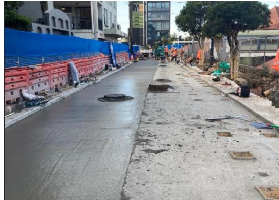
Images above show the start of construction on Marian Street (left) and Little Eveleigh Street (right) into new shared zones.