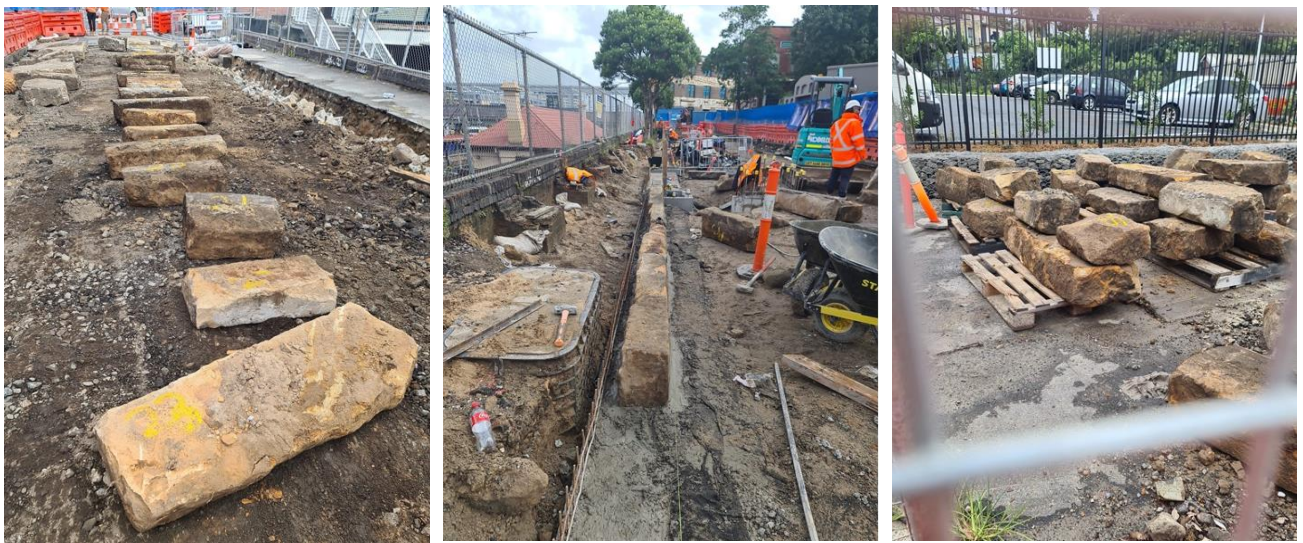
Images above (left to right): Images show the discovery of the sandstone blocks, their repurposing on Little Eveleigh Street and the remaining blocks ready for collection and placement in their new home in the Sydney CBD.

Make sure to keep an eye out for these kerbs once stage one of the shared zone is complete!