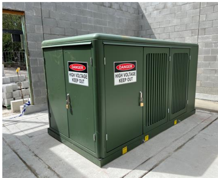
Image 2: The new transformer in place within the electrical building at the Marian Street compound.