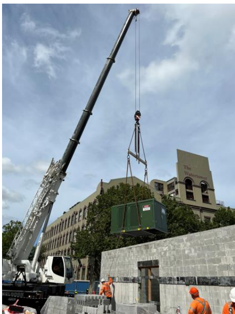
Image 1: The new transformer being lifted by crane into the Marian Street compound.

This transformer will bring in power from substations around Redfern to supply electricity to the New Southern Concourse. It will be used to power the Marian Street and Little Eveleigh Street station entrances, the new lights, and passenger information displays when in operation.