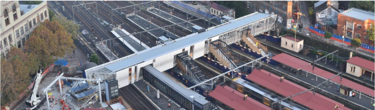
Image above shows the start of construction on the new station entrance canopy on Marian Street.