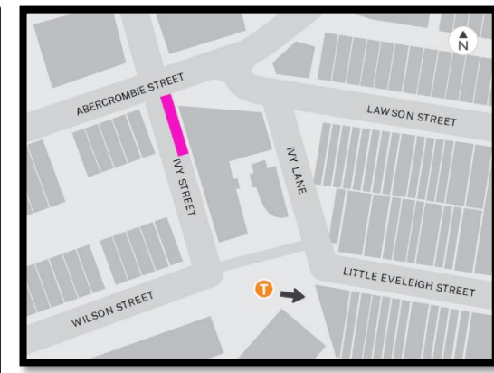
Above: maps showing temporary parking changes on Wilson and Ivy Streets