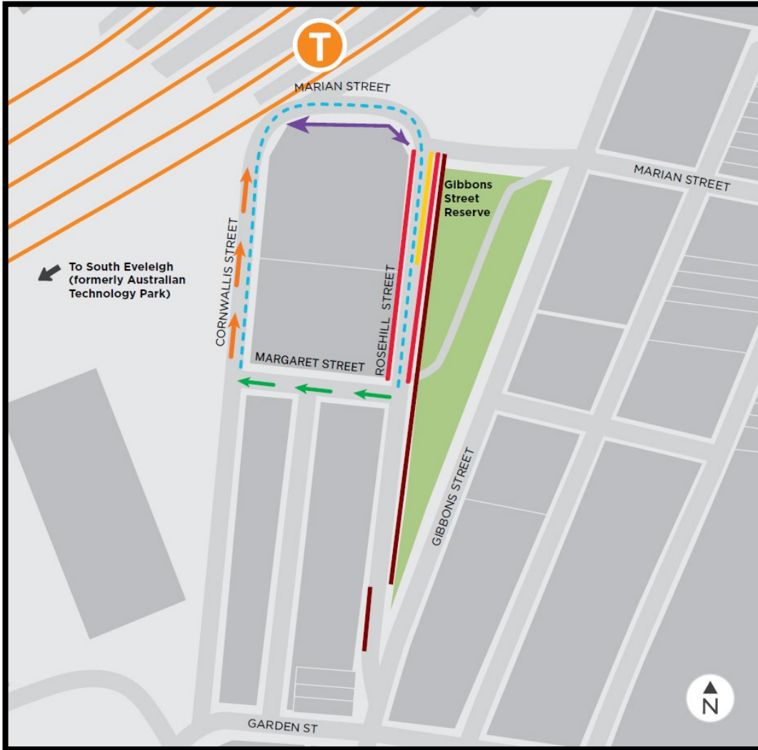
Above: map showing temporary parking and traffic changes on Marian and Rosehill Streets