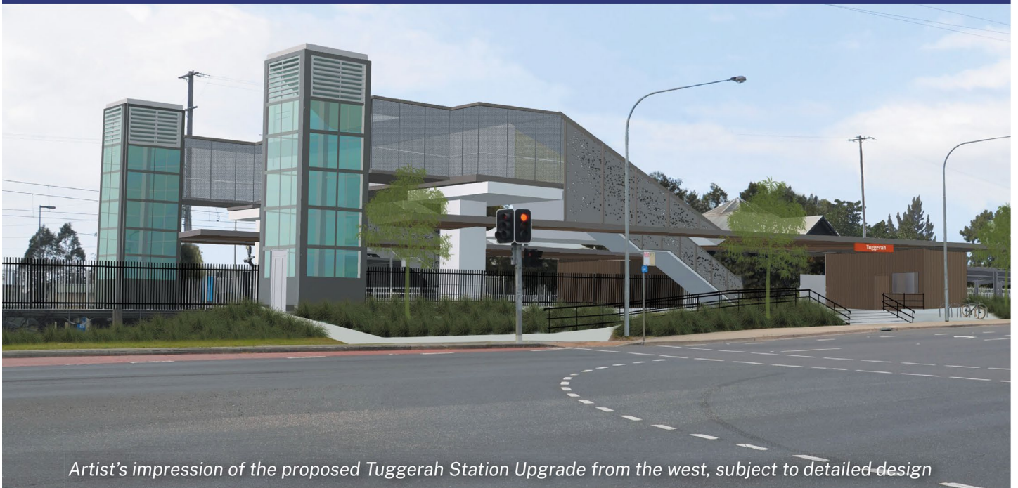
Artist's impression of the proposed Tuggerah Station Upgrade from the west, subject to detailed design