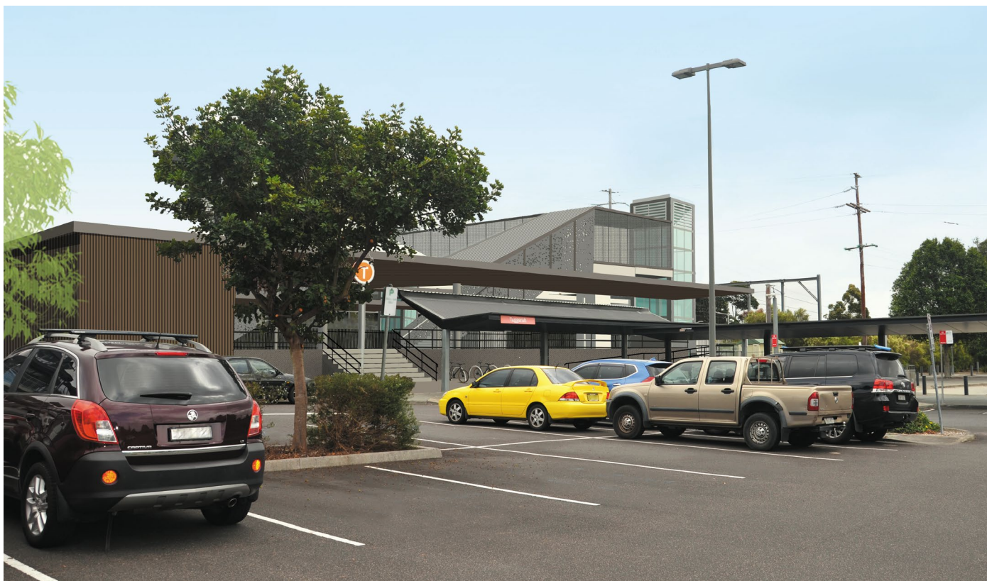
Artist's impression of the proposed Tuggerah Station Upgrade from the east, subject to detailed design