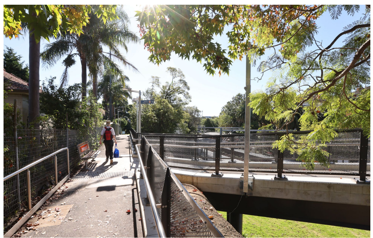
New footbridge, landscaping and ramp facilities at Wollstonecraft Station