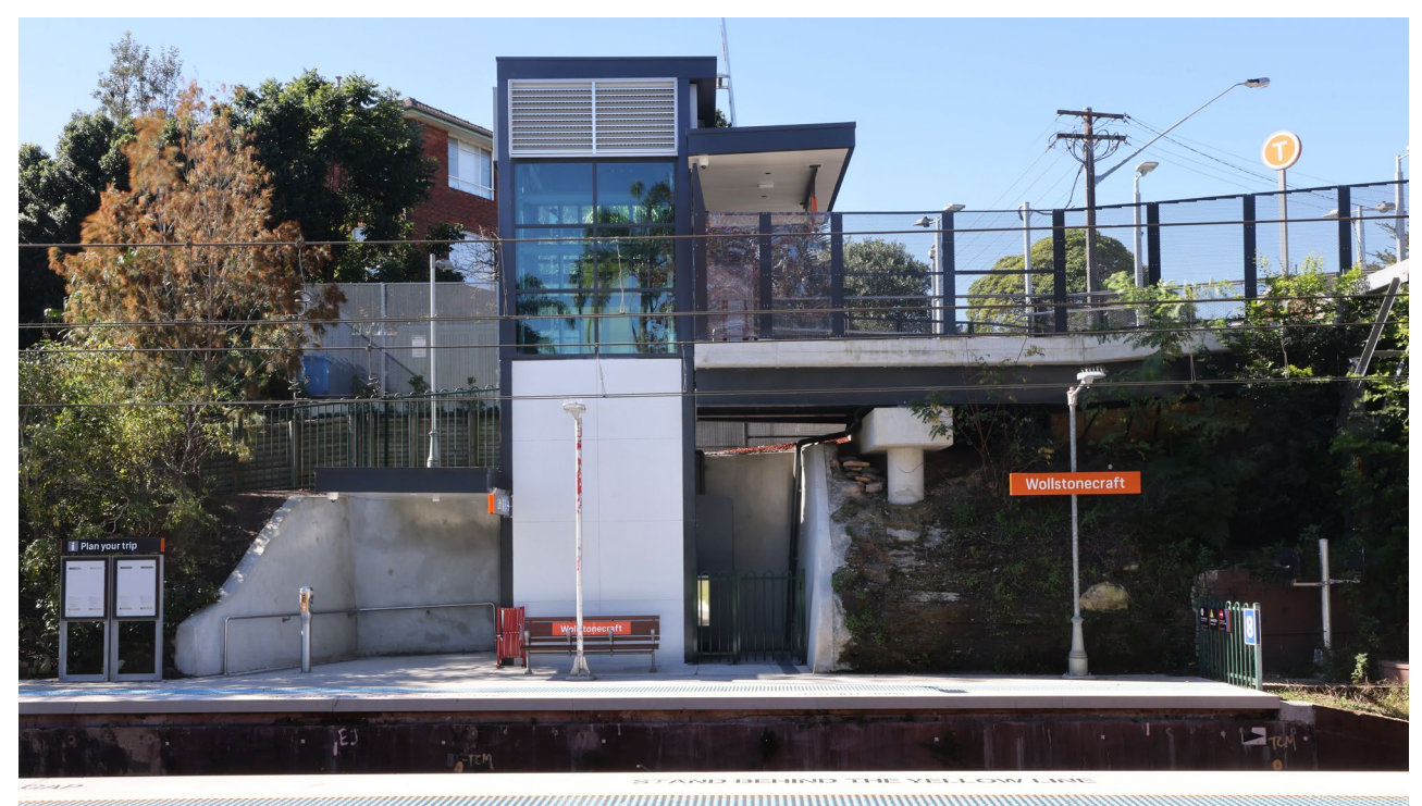
New lift, landscaping and ramp facilities on Platform 2 at Wollstonecraft Station