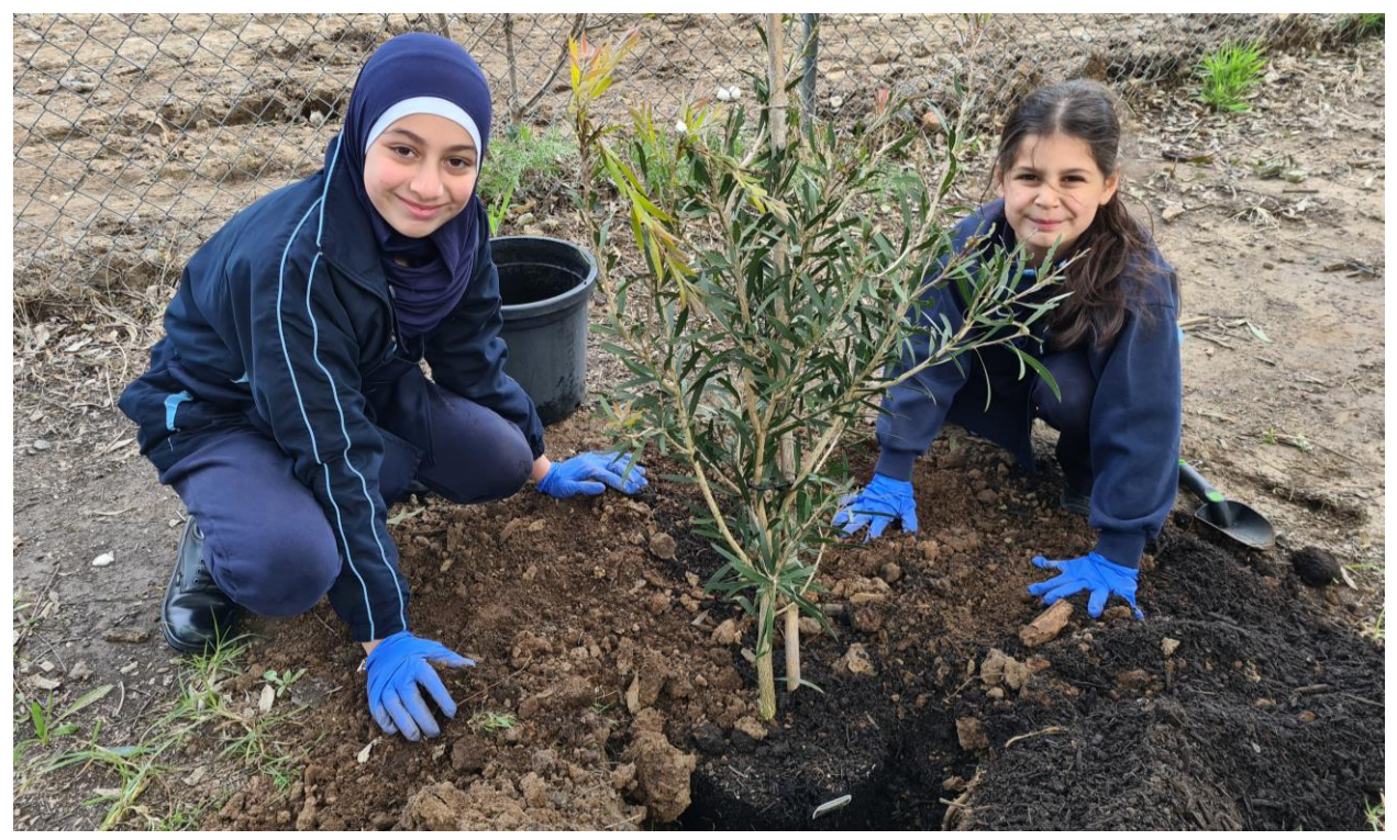
Above: The project team joined students to plant trees at Yagoona Public School in July 2022.

We would like to thank the community for their patience while we completed this important upgrade. For more information, visit transport.nsw.gov.au/yagoona or please contact us on 1800 684 490 or email projects@transport.nsw.gov.au .