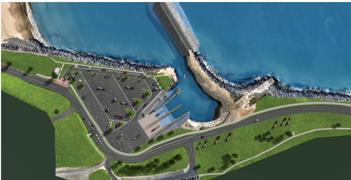
Artist's impression of an aerial overview of the completed project