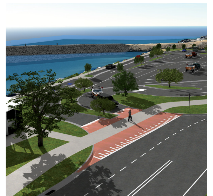
Artist's impression of the carpark entrance