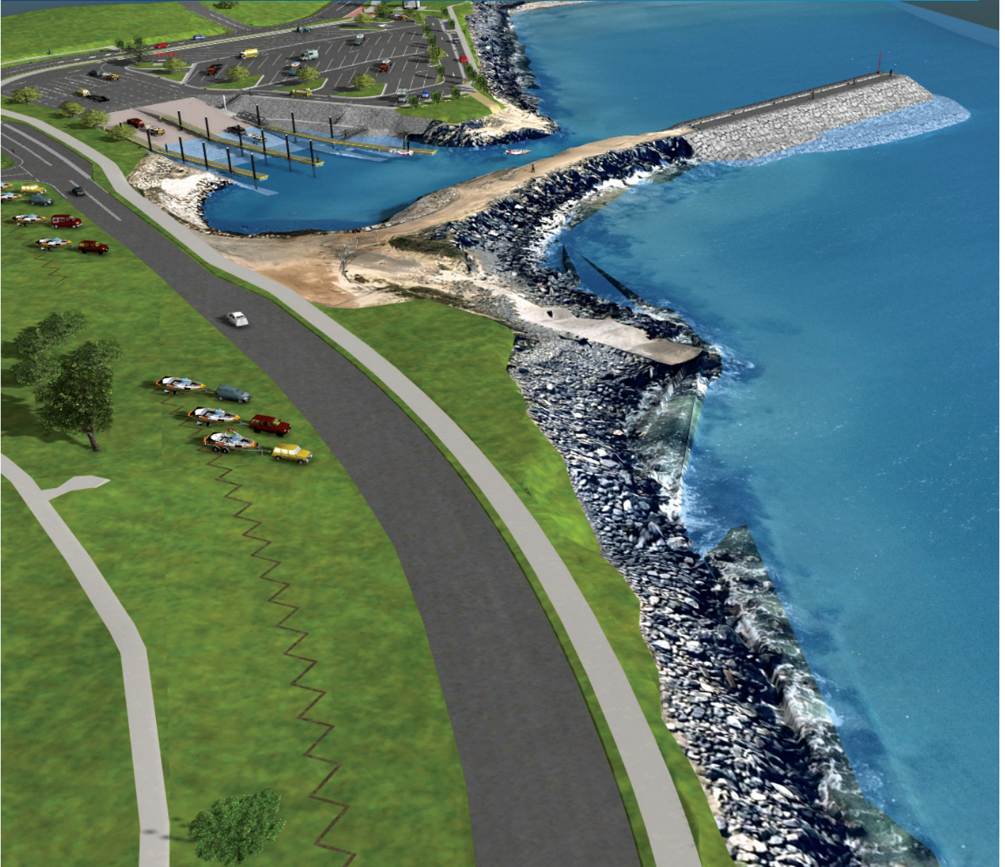
Artist's impression of the completed boat ramp and surrounds

Transport for NSW Maritime is beginning construction on the upgrade to the Coffs Harbour Regional Boat Ramp to increase the size of the ramp, provide better facilities and increase parking options.