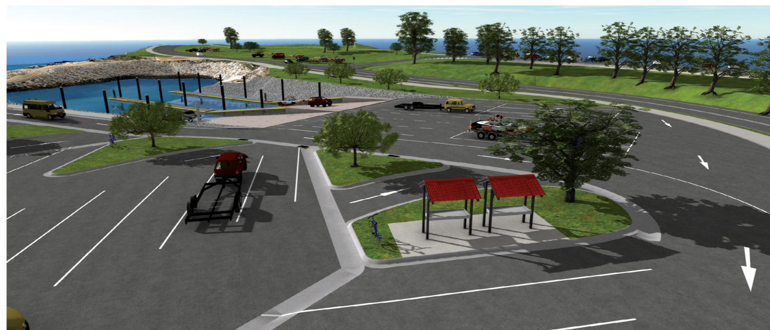
Artist's impression of the fish cleaning tables