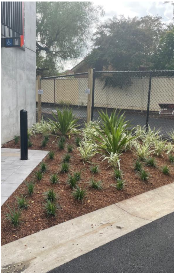
New plants at the station entry