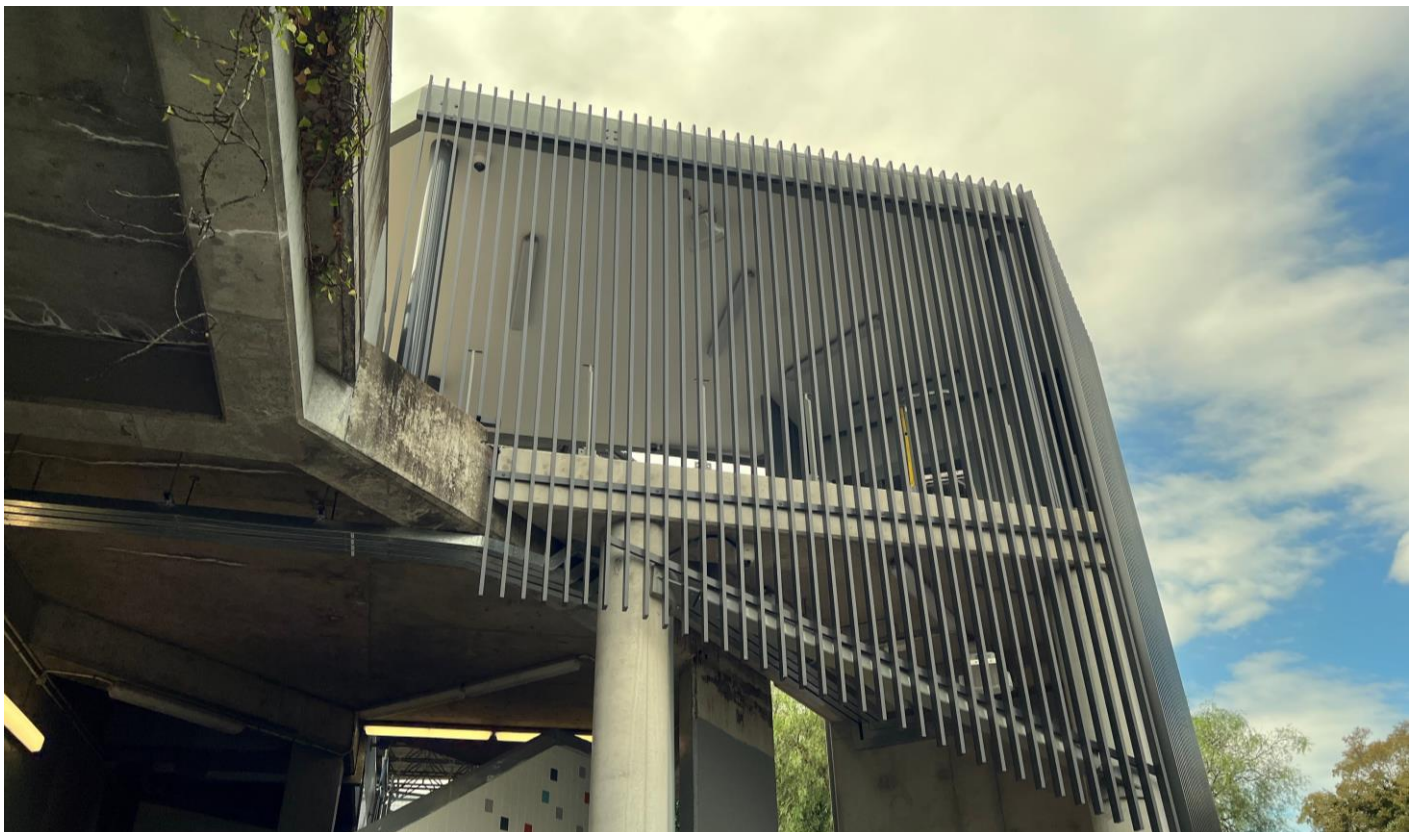
Station entry from Thompson Lane