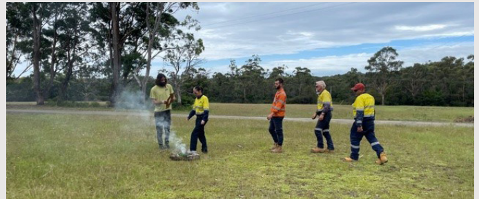
Smoking ceremony held as part of the Cultural Empathy Experience.