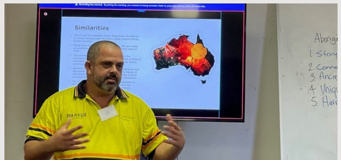
Presentation by the Eden LALC on site.