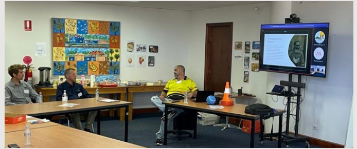
LALC Cultural Empathy Experience on site.

The Eden Safe Harbour Project has employed members from the Eden LALC and the Twofold Aboriginal Corporation to form part of the construction team. Transport's Reconciliation Action Plan initiatives focus on meaningful community engagement, which aims to improve the participation of Aboriginal people and businesses through employment opportunities and upskilling throughout the Eden Safe Harbour Project.