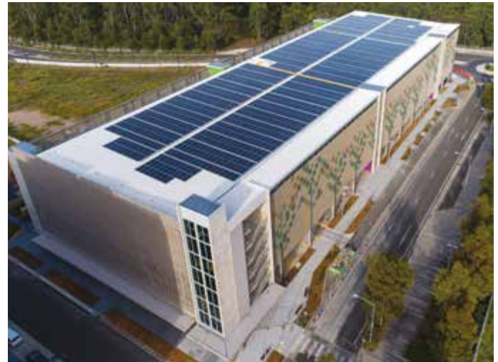
The rooftop has over 1500 solar panels to help power the car park