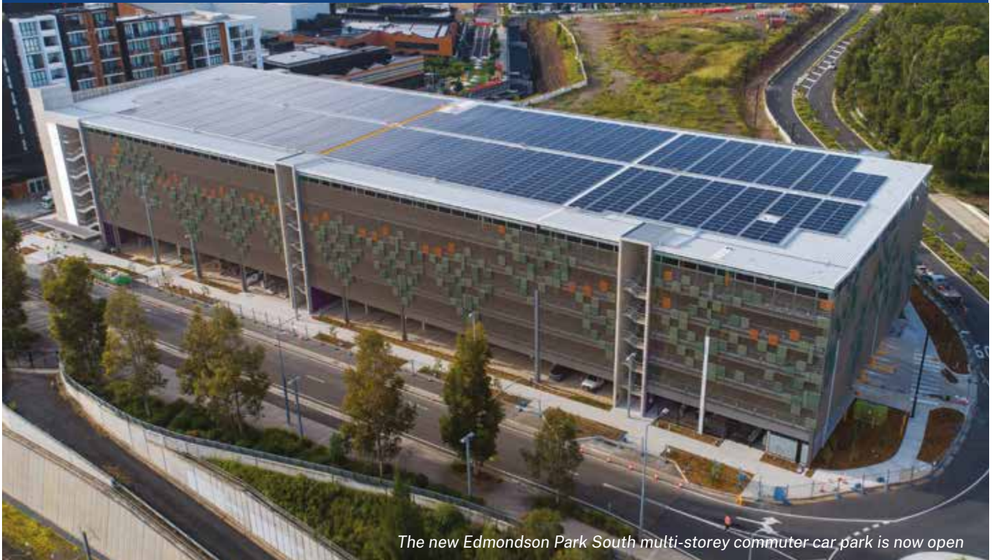
The new Edmondson Park South multi-storey commuter car park is now open

The newly completed Edmondson Park South Commuter Car Park provides over 1,250 additional parking spaces for transport customers, with planning underway for a second car park to provide up to 700 additional spaces north of the station.