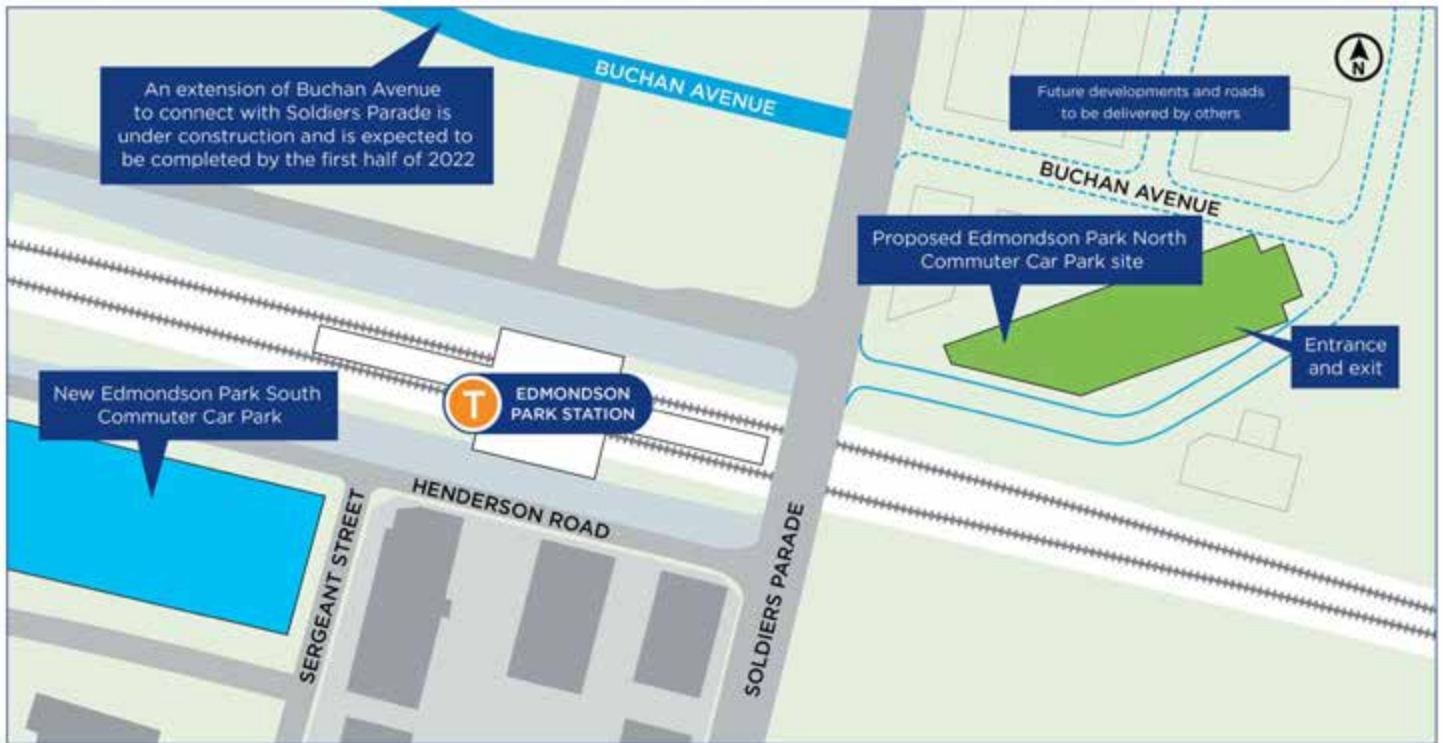
Site map of the new Edmondson Park South commuter car park and proposed Edmondson Park North commuter car park, subject to detailed design

The temporary car park located north of Edmondson Park Station will be closed from Sunday 27 February. In the coming months, you may notice some upgrades to the existing pedestrian crossing on Henderson Rd.