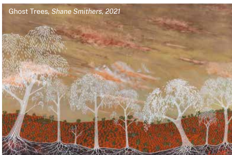
Ghost Trees, Shane Smithers, 2021

Generations of clearing, grazing, farming and the urban sprawl took its toll on the woodland. The western façade of the building acknowledges the loss of Cumberland Woodland incorporating a kind of modern pixelated powder-coated steel expression of a lost woodland. The eastern face looks toward urban development. This context invites the telling of a different story, not of the destruction of the woodland, but of its urban regeneration.