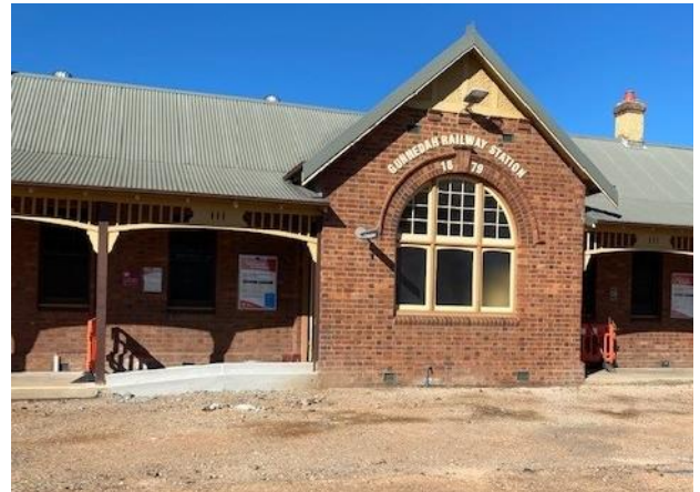
Construction: New ramp into waiting room entry