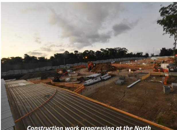
Construction work progressing at the North

We understand that our work may be noisy at times. We will do everything we can to lessen the impact including turning off vehicles and equipment when not in use and using non-tonal reversing beepers.