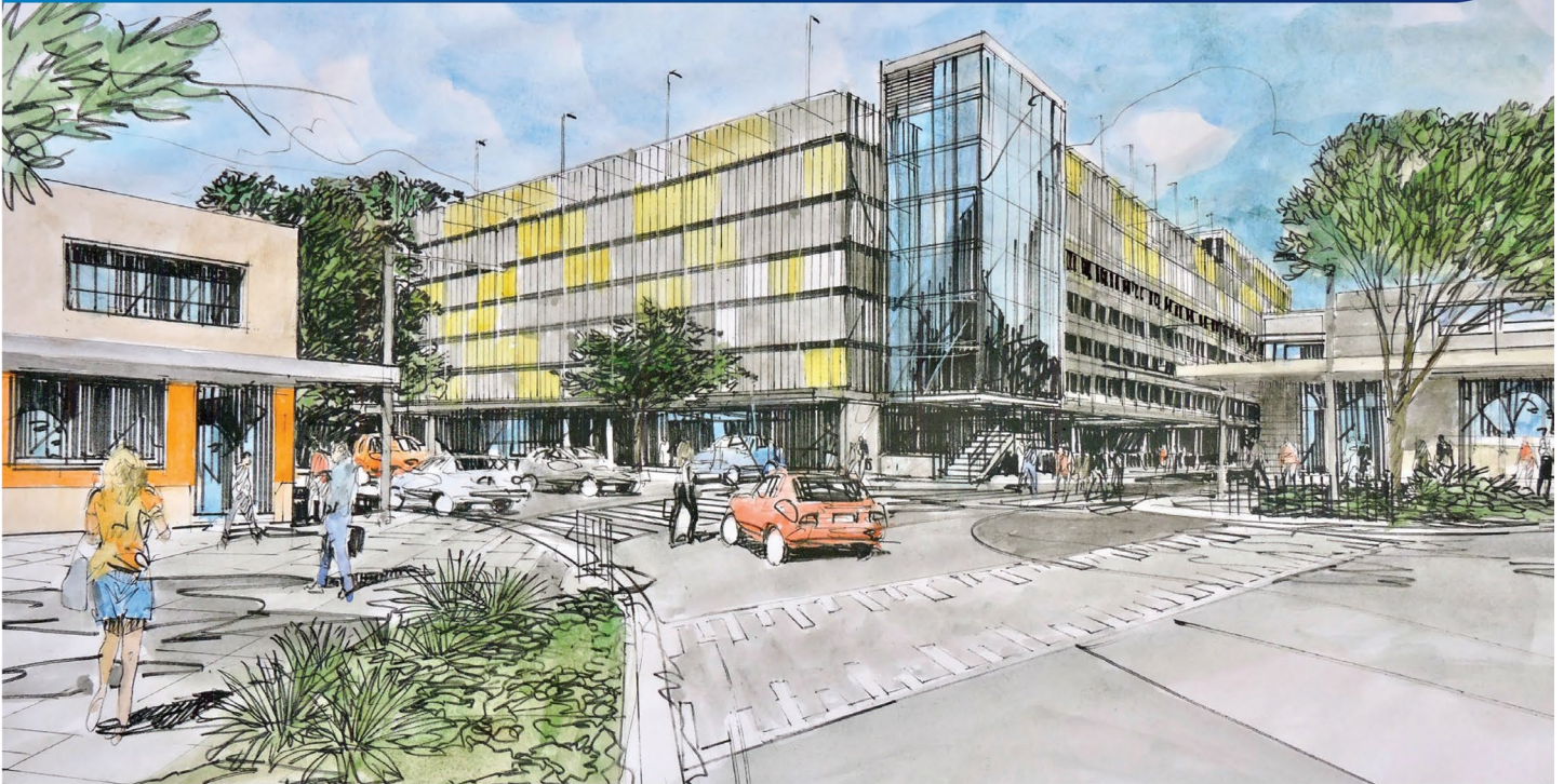
Artist's impression of the additional parking at Revesby Station, subject to planning approval and detailed design